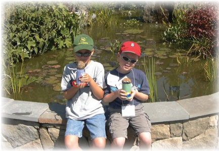
Junior Master Gardeners