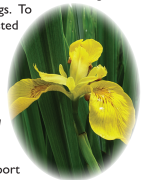
Yellow flag iris bloom

For a copy of the CIPC Priority Species List, or if you believe that you have found YFI growing in the wild, please report it to the CIPC by calling our weed hotline at 250-857-2472. To find out more information about invasive plants in your region, visit our website at: www.coastalinvasiveplants.com , or email the CIPC Coordinator at: info@coastalinvasiveplants.com .