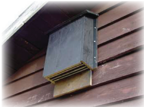
An example of a Bat house

You can also take the pledge on-line at: http://www.crd.bc.ca/takethepledge/ or in person at the Municipal Hall (3rd floor, Planning Department) or at the Parks office at 1040 McKenzie Ave. Both these locations have lawn stakes ready for pick up if you have already taken the pledge!