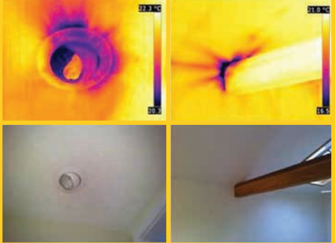
Is Your Home Leaking Heat and Money?

Start your savings today by contacting City Green at 250-381-9995 or savings@citygreen.ca, or visit www.citygreen.ca tolearn more.