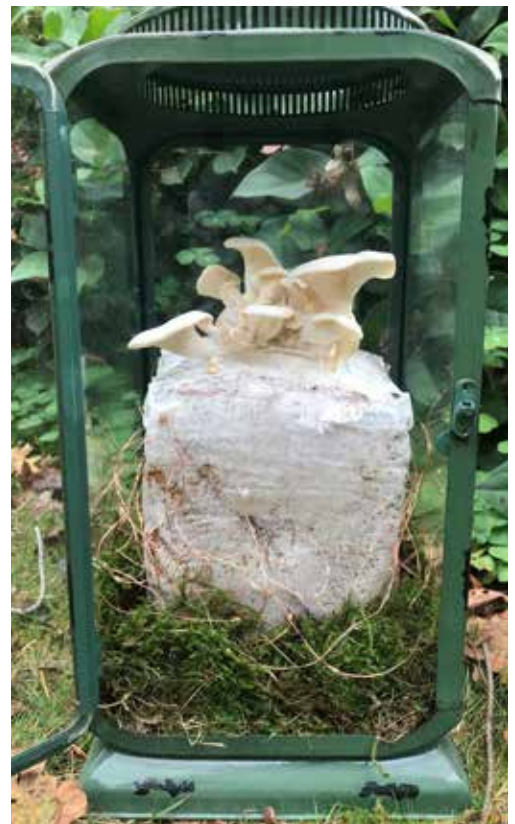
Oyster Mushroom Kit.

These interactive and educational kits will delight the budding scientist, artist, and cook of any age and will grow your connection to nature from the comfort of your own home.