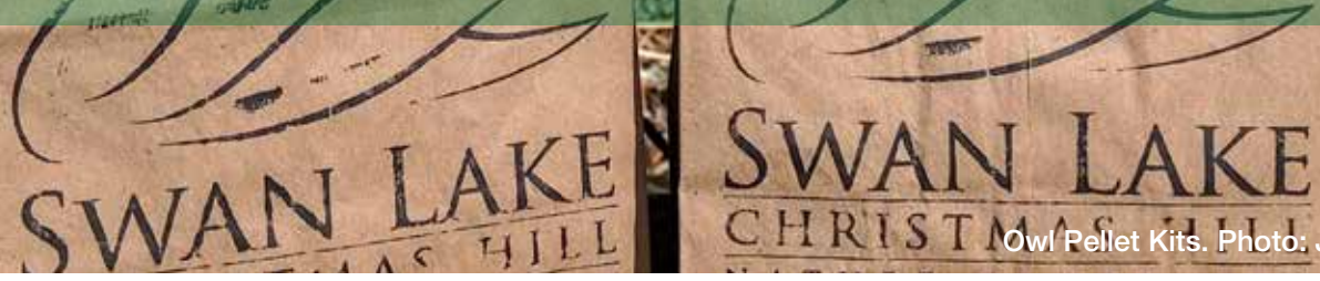
Owl Pellet Kits.