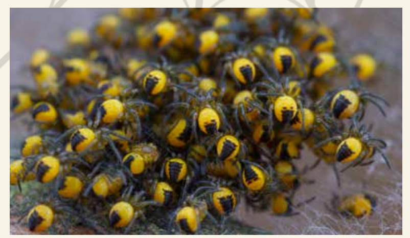
Garden Cross Orbweaver spiderlings ( Araneus diadematus)