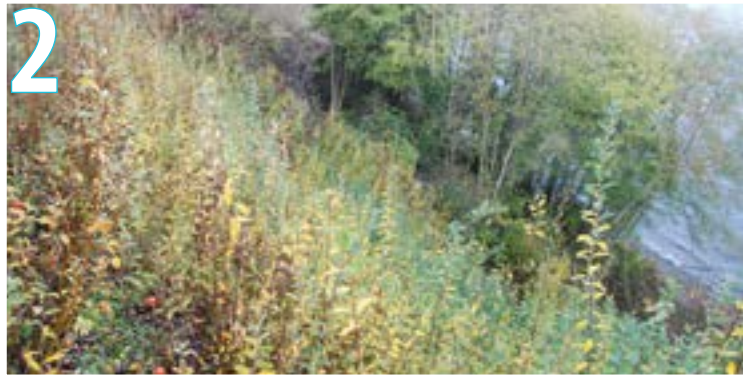
Photograph 1 and 2. Steep (65° in this case) slopes can be treated with small retaining walls built of live cuttings (left). These then sprout and grow, creating a dense cover of pioneering vegetation on the slopes.

Soil bioengineering systems can also be used on stream banks to address erosion issues. A technique known o as dense live staking can be used down at the water level to slow flow velocities and allow sediments to collect rather than eroding. Photograph 3 and 4 show a site where dense live staking was used in combination with wattle fences to address toe erosion on a large river that had caused a slump of the river bank. By providing effective riparian vegetation, dense live staking creates habitat for a variety of species.