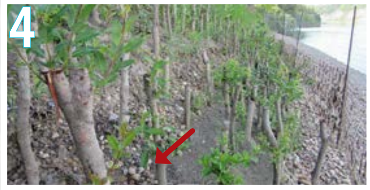
Photograph 3 and 4. Dense live staking can be used where erosion is causing a problem. The dense pattern of the live stakes slows the flow velocity of the river and allows sediment to be deposited (red arrow).