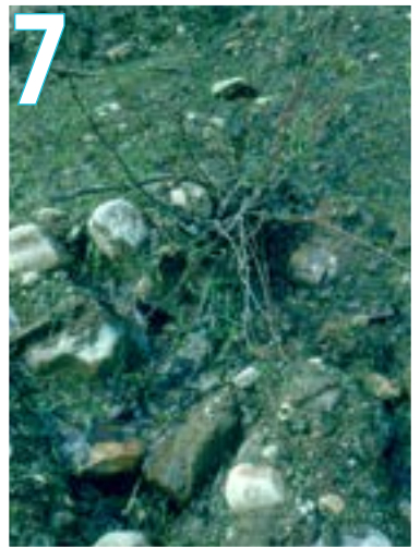
Photograph 5, 6 and 7. Live pole drains are bundles of living cuttings that provide a preferred flow path for soil moisture, draining excessively wet sites. They continue to drain the site for many years.

Soil bioengineering solutions are usually about 1/10th the cost of a typical engineering solution for the same problem. In addition, because soil bioengineering uses living plant material, the growth of the vegetation supports a diversity of wildlife.