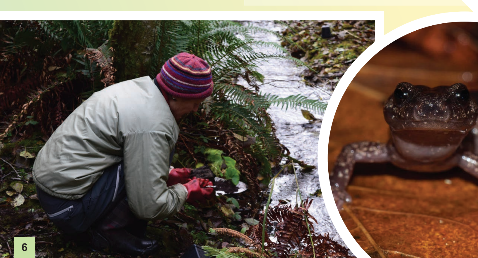
Photo credit for images (left to right) 1: Planting native plants in riparian habitat. Photo: Kathleen Cathcart. 2: A charismatic Wandering Salamander by Kristiina Ovaska. 3: A Northern Red-legged Frog in its natural environment. One of the seven different species found during HAT's road-kill surveys.

To help our native amphibians, please report sites where there are concentrations of amphibian road-kill or dead amphibians. If you have a pond or forest on your property, join HAT's Stewardship Program to learn how you can support amphibian-friendly habitat and be a part of the solution. To contact HAT and become a volunteer, member, or learn more reach out to: email hatmail@hat.bc.ca, call 250-995-2428 or visit www.hat.bc.ca.