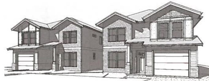
2 3D View 1