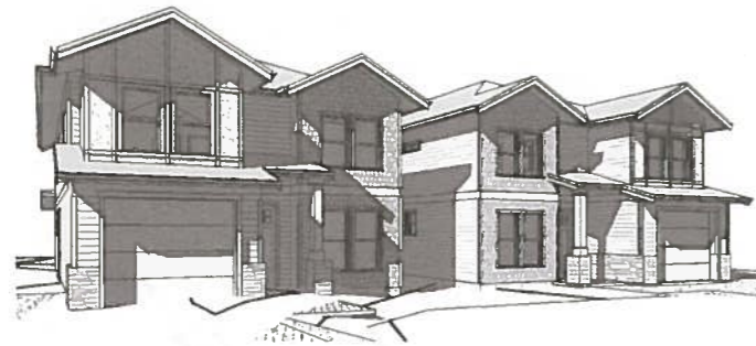
3 3D View 2