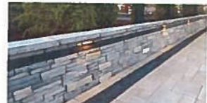
BLOCK WALL LIGHTING STYLE TO BE DETERMINED