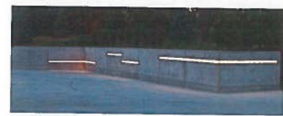
CONCRETE SITWALL LIGHTING LINEAR LED LIGHTING