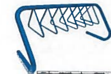
CORA EXP APPROVED POWDER TO BE DET BIKE RACK