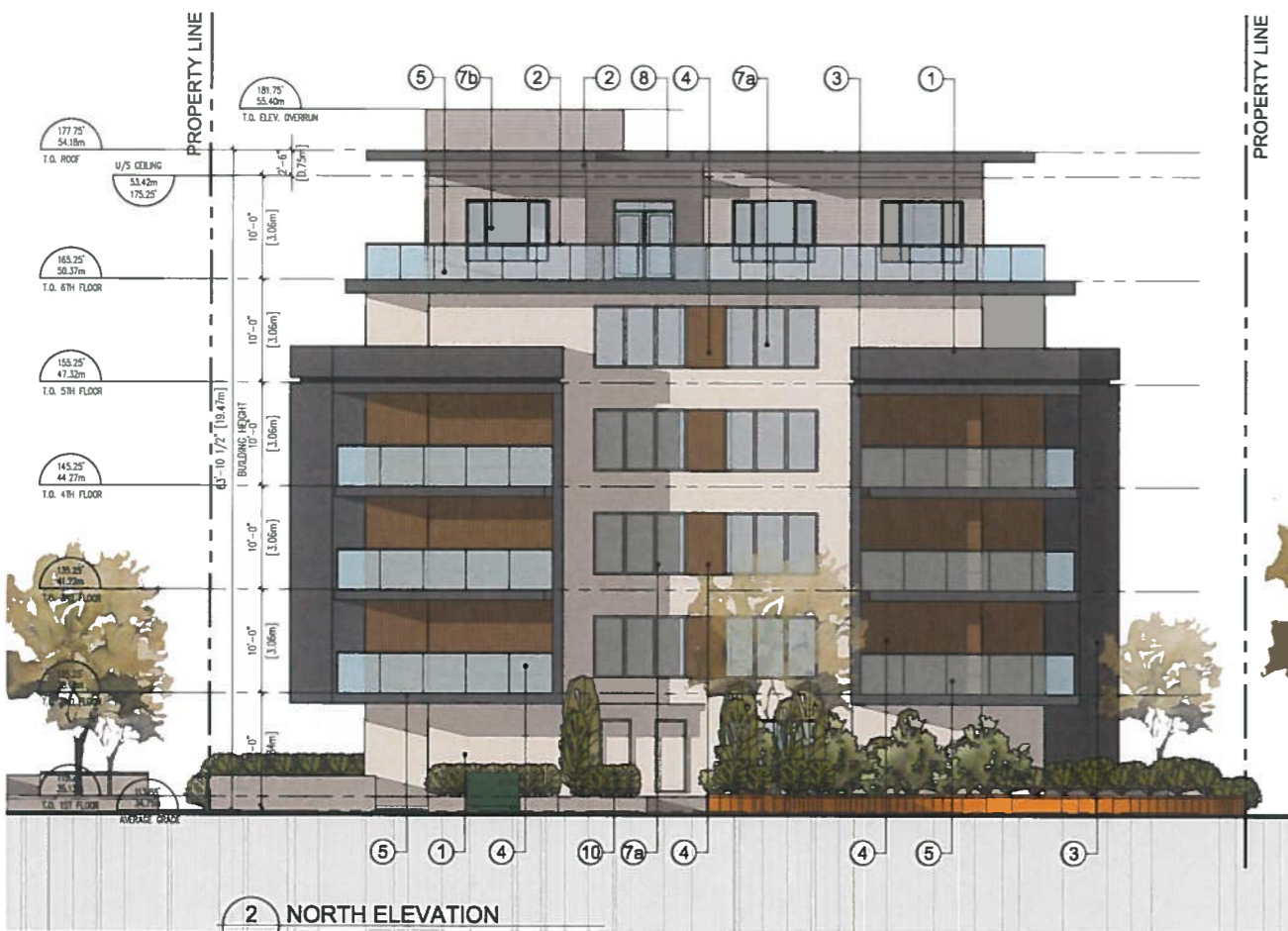
2 NORTH ELEVATION 1:100