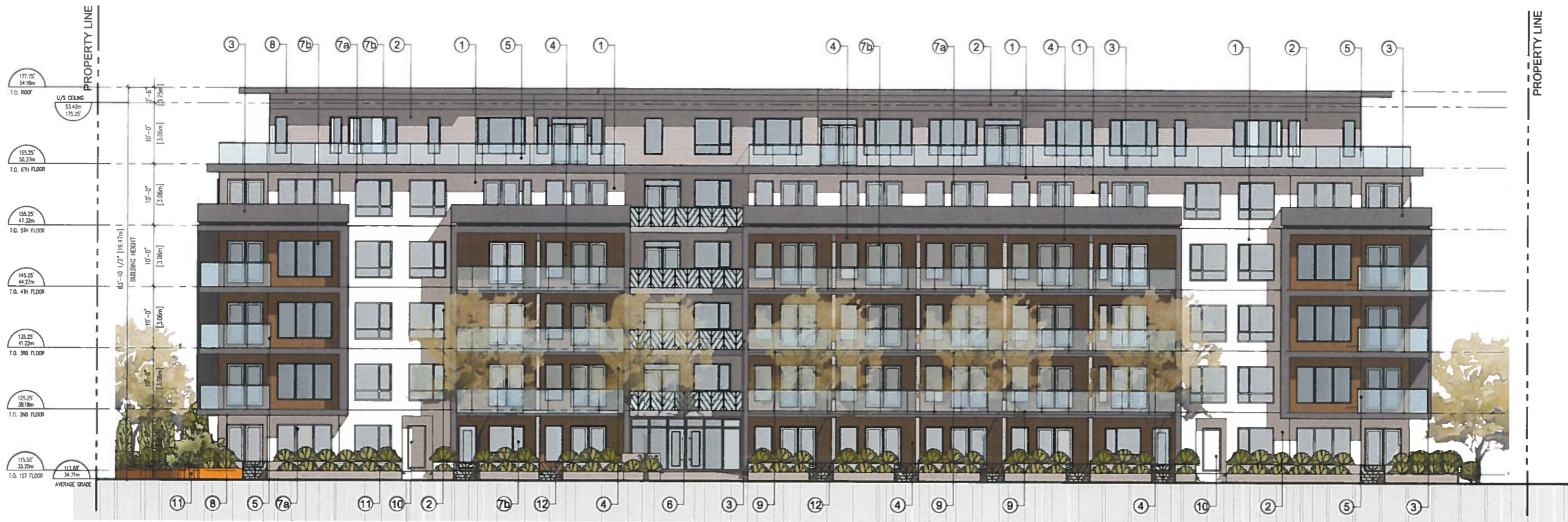
1 WEST ELEVATION 1:100

PROJECT NO: 19058 DRAWN BY: XV SCALE: 1:100 REVIEW BY: DM DWG NO: A301