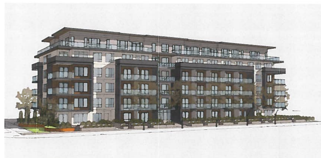
3 NORTH-EAST VIEW NTS