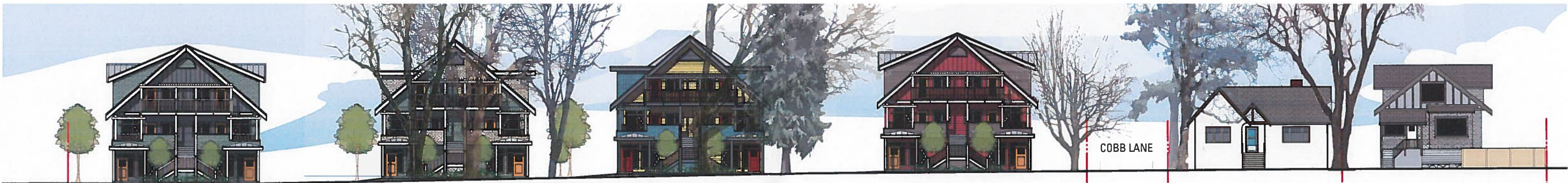
Cook Street Elevation scale: 1 : 150