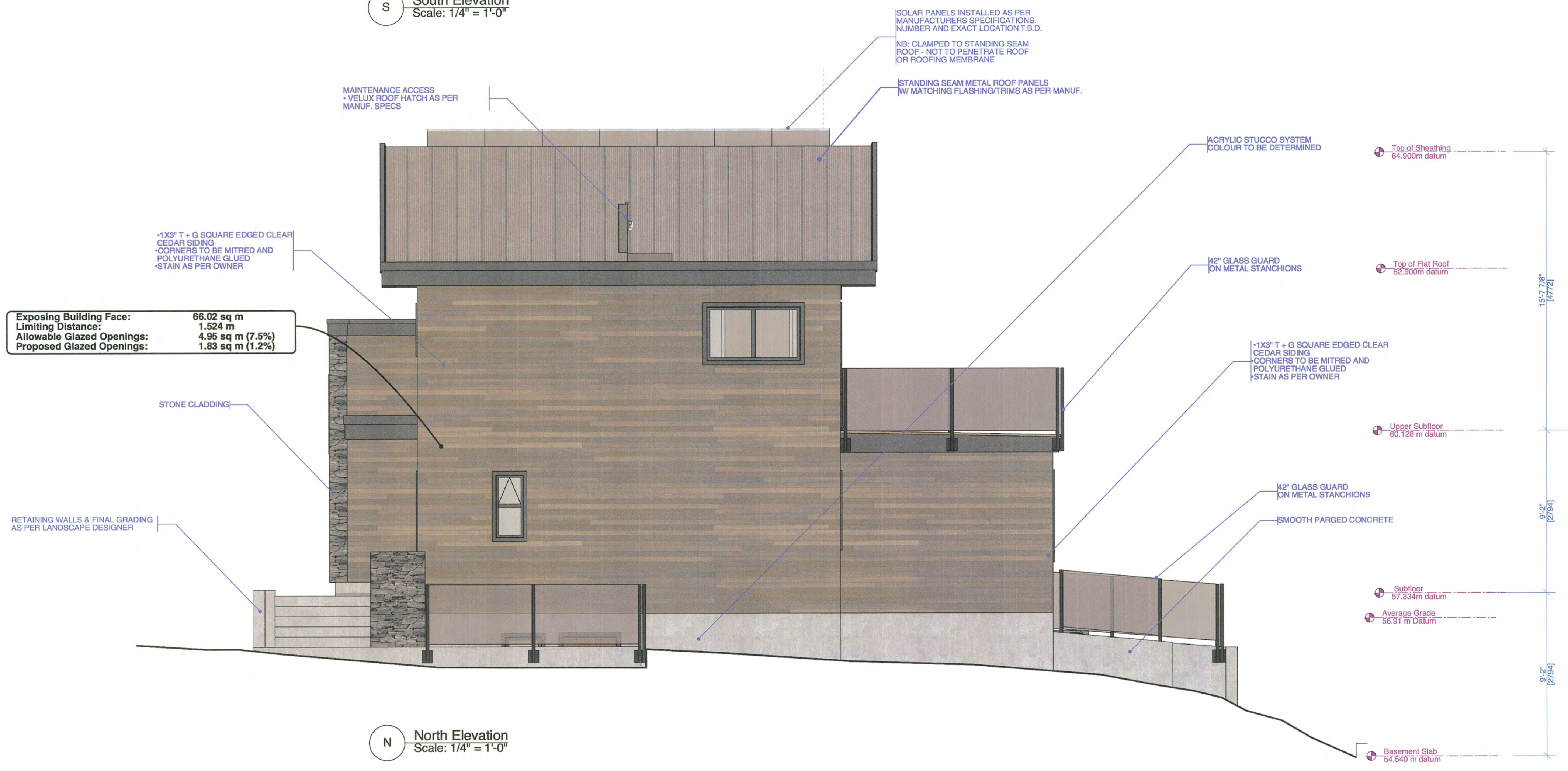
N North Elevation Scale: 1/4" = 1'-0"

REPRODUCTION NOTE: THESE DRAWINGS ARE MEANT TO BE PRINTED IN COLOUR FOR CLARITY.