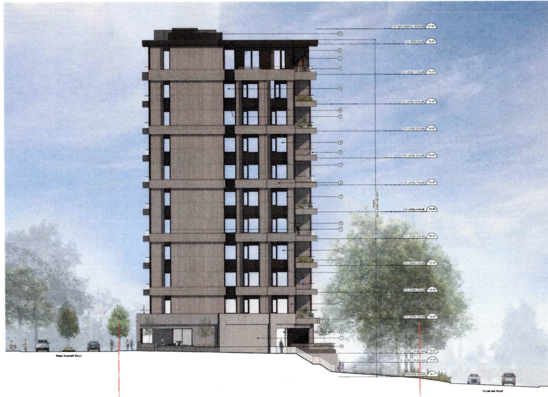
1 North Elevation Scale: 1/8" = 1'-0"

RECEIVED APR 10 2024 PLANNING DEPT. DISTRICT OF SAANICH