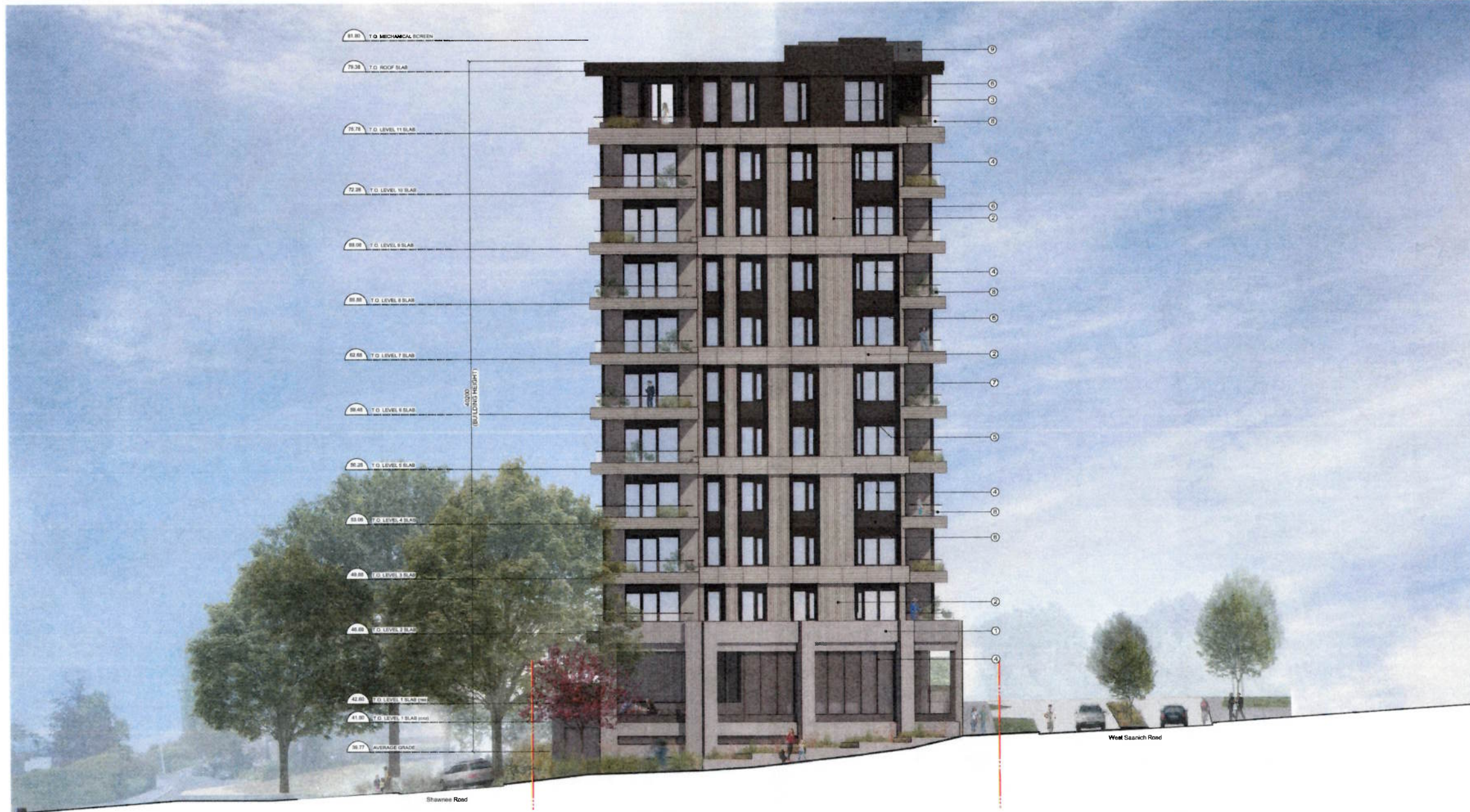
1 South Elevation Scale: 1/100

RECEIVED APR 10 2024 PLANNING DEPT. DISTRICT OF SAANICH