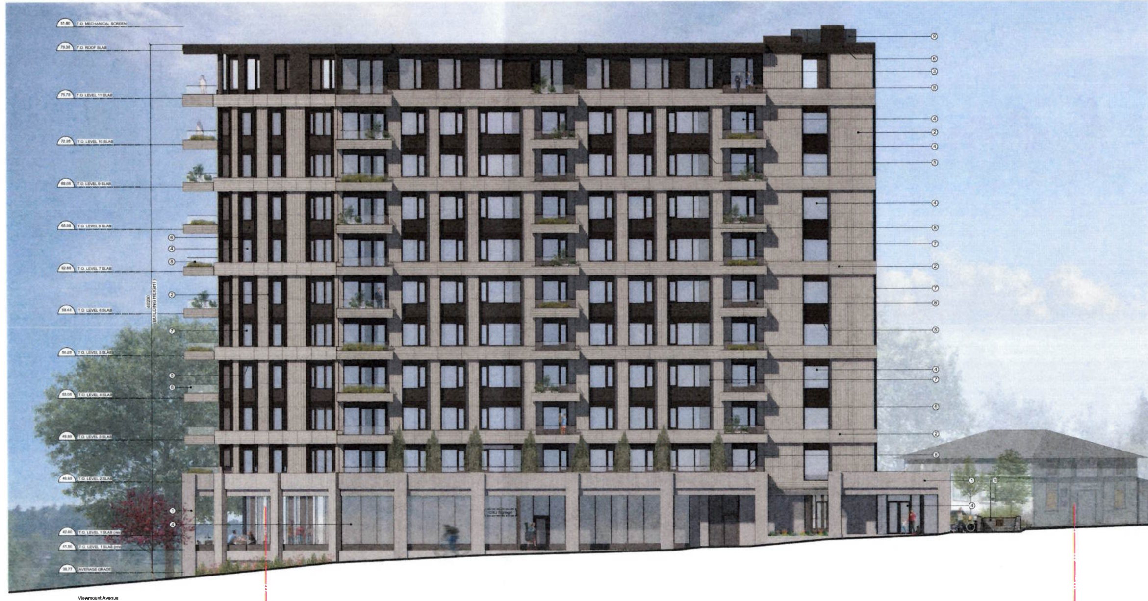
1 East Elevation Scale: 1/80'

RECEIVED APR 10 2024 PLANNING DEPT. DISTRICT OF SAANICH