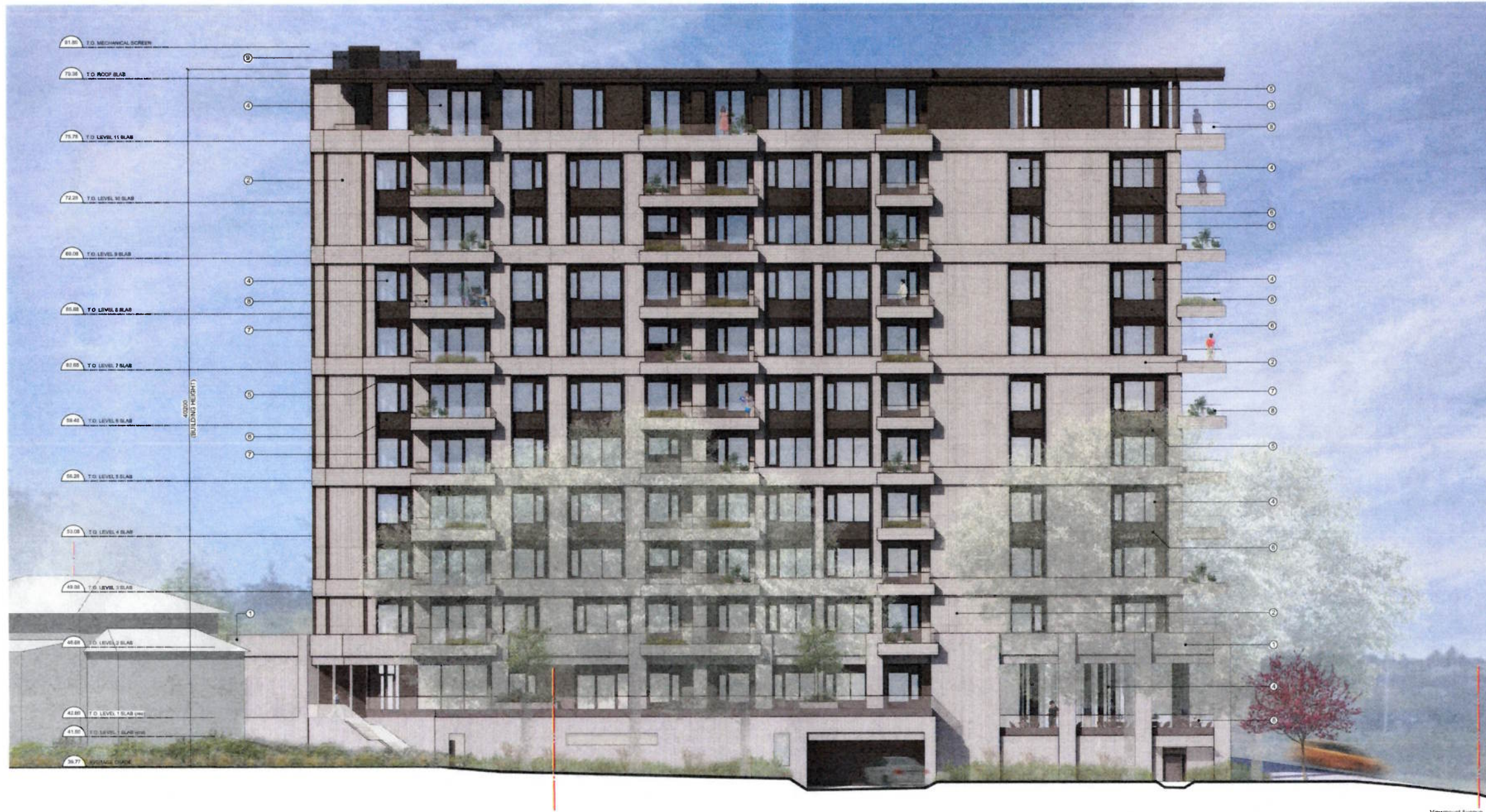
1 West Elevation Scale: 1/8" = 1'-0"