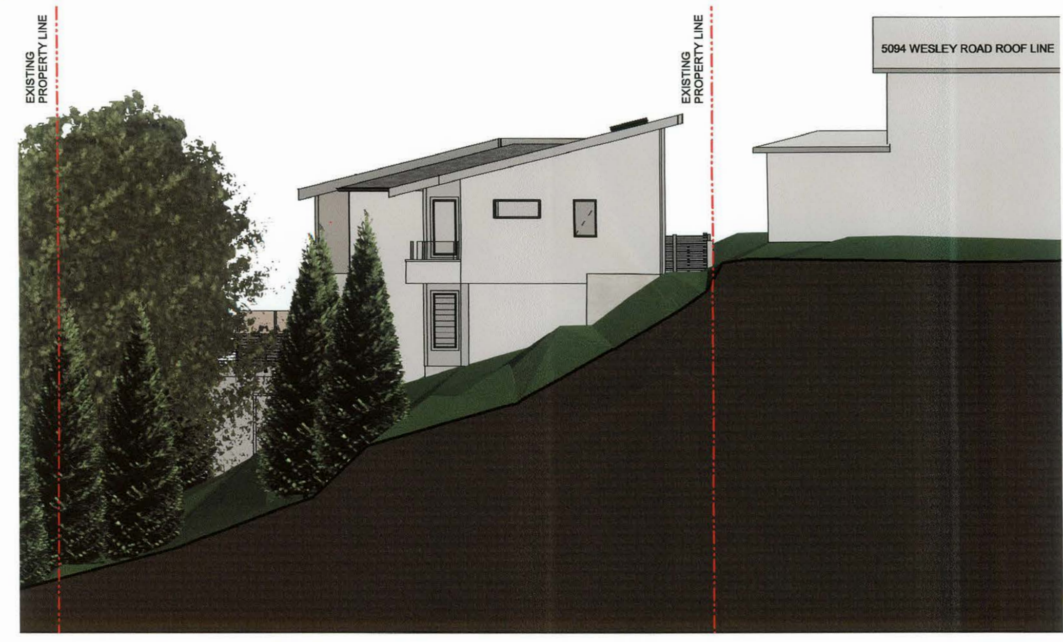
③ Development Elevations - West 3/32" = 1'-0"