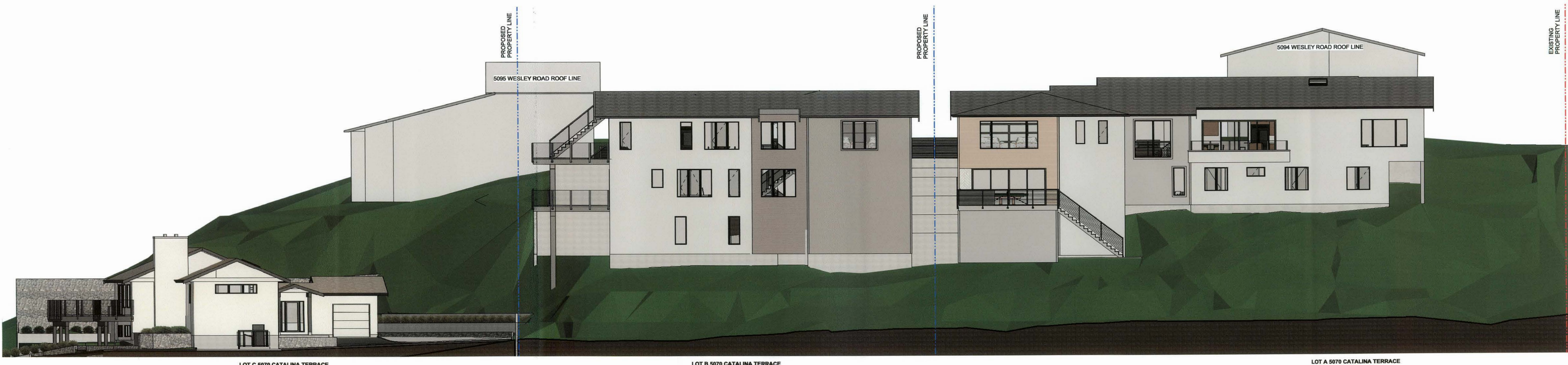
① Development Elevation - North 3/32" = 1'-0"