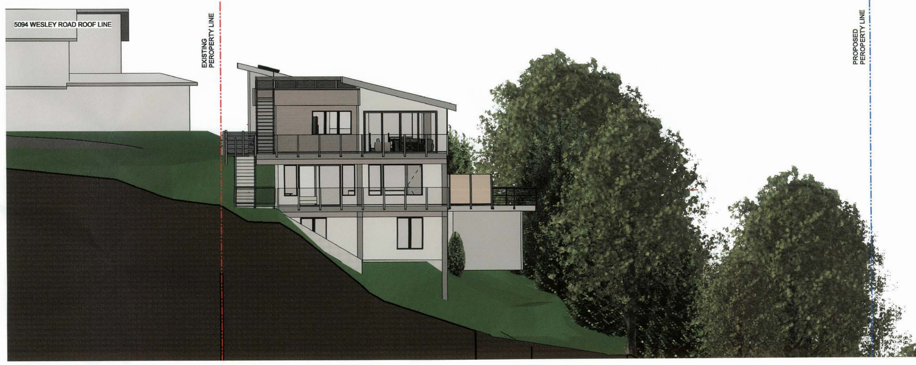
② Development Elevations - East 3/32" = 1'-0"