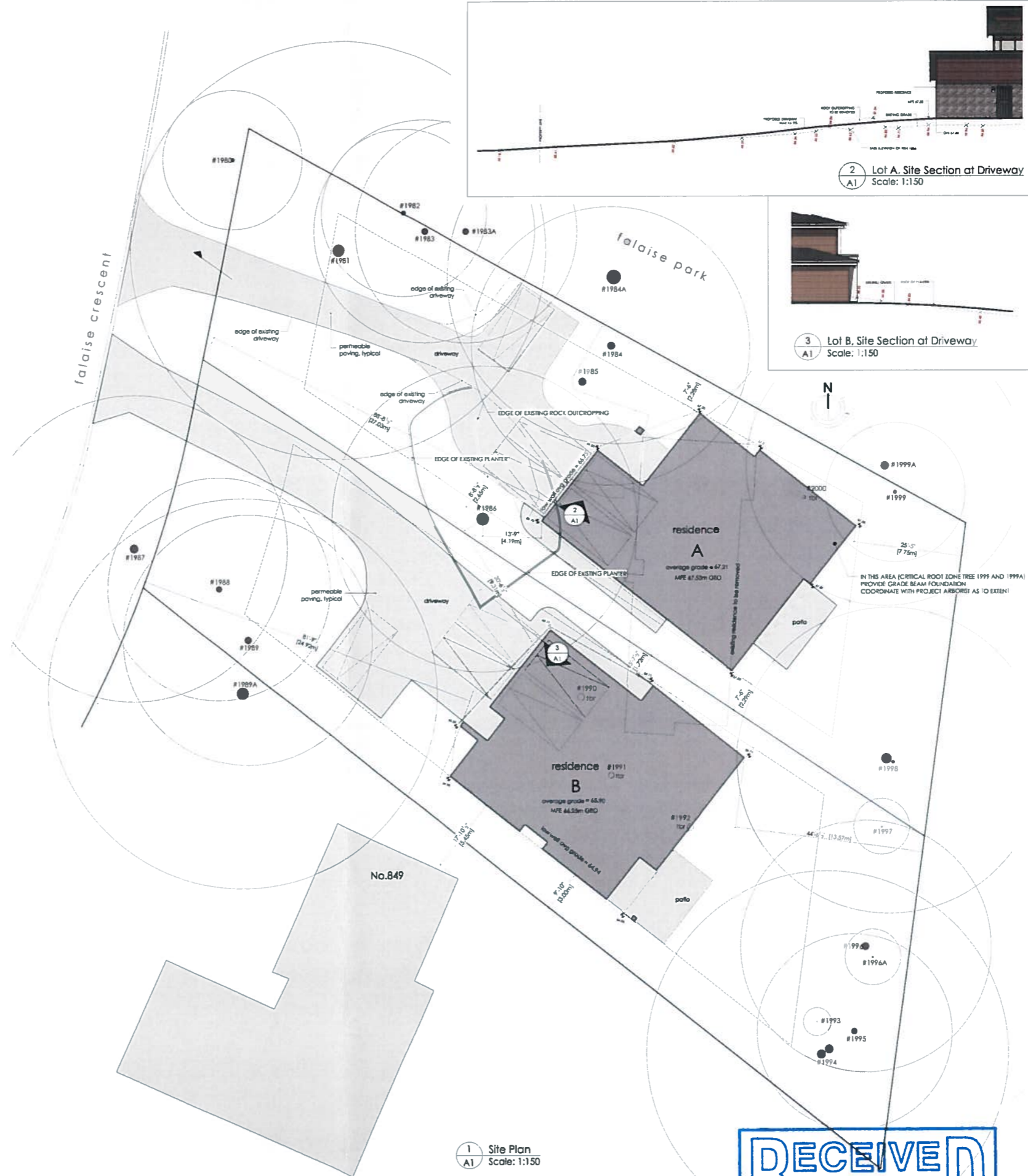
1 Site Plan Scale: 1:150