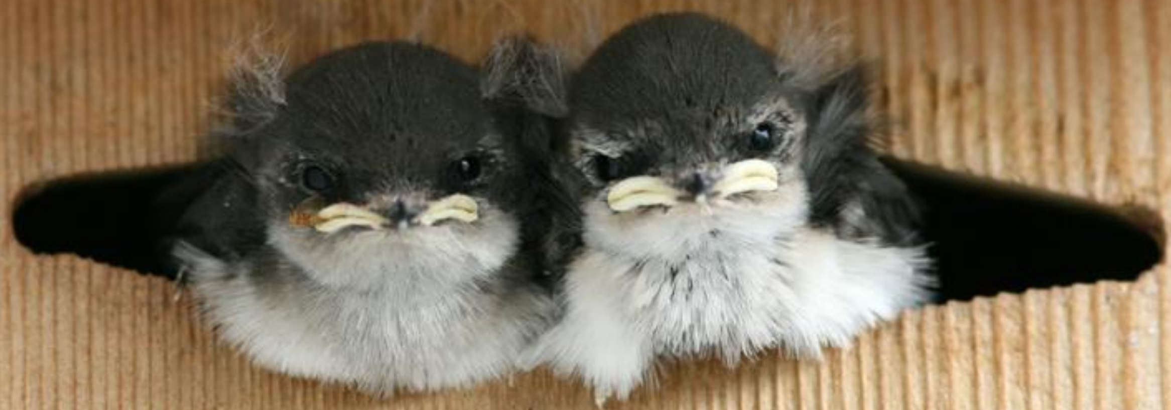
Violet-green Swallow hatchlings