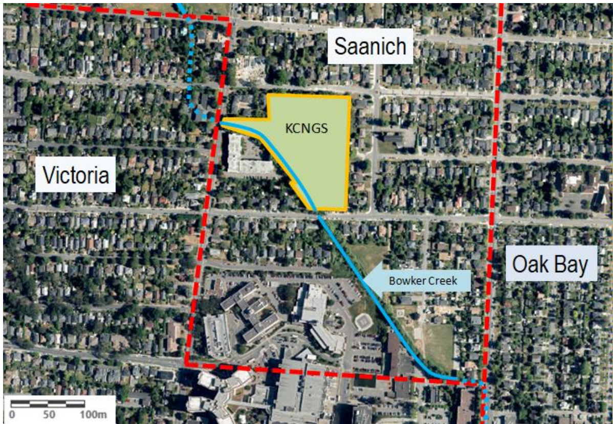
Map 1. Proximity of the KCNGS to Victoria and Oak Bay and Jubilee Hospital