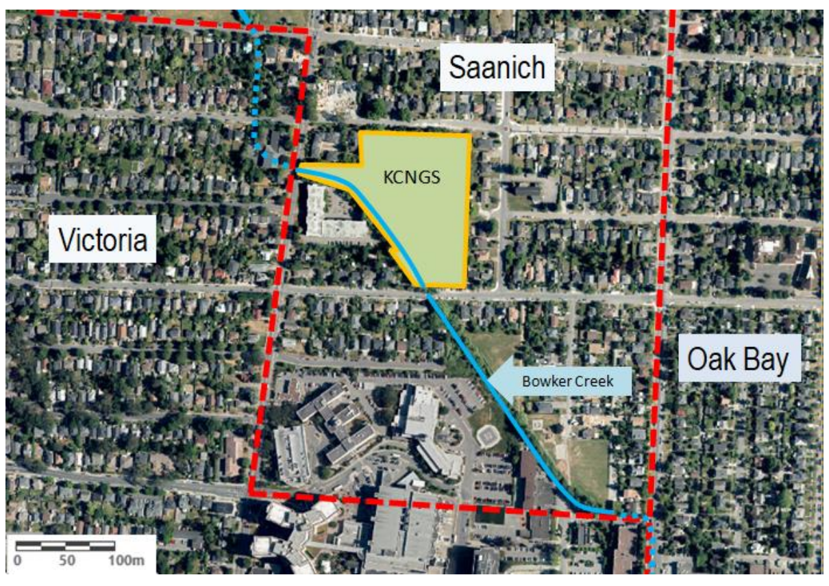
Map 1. Proximity of the KCNGS to Victoria and Oak Bay and Jubilee Hospital