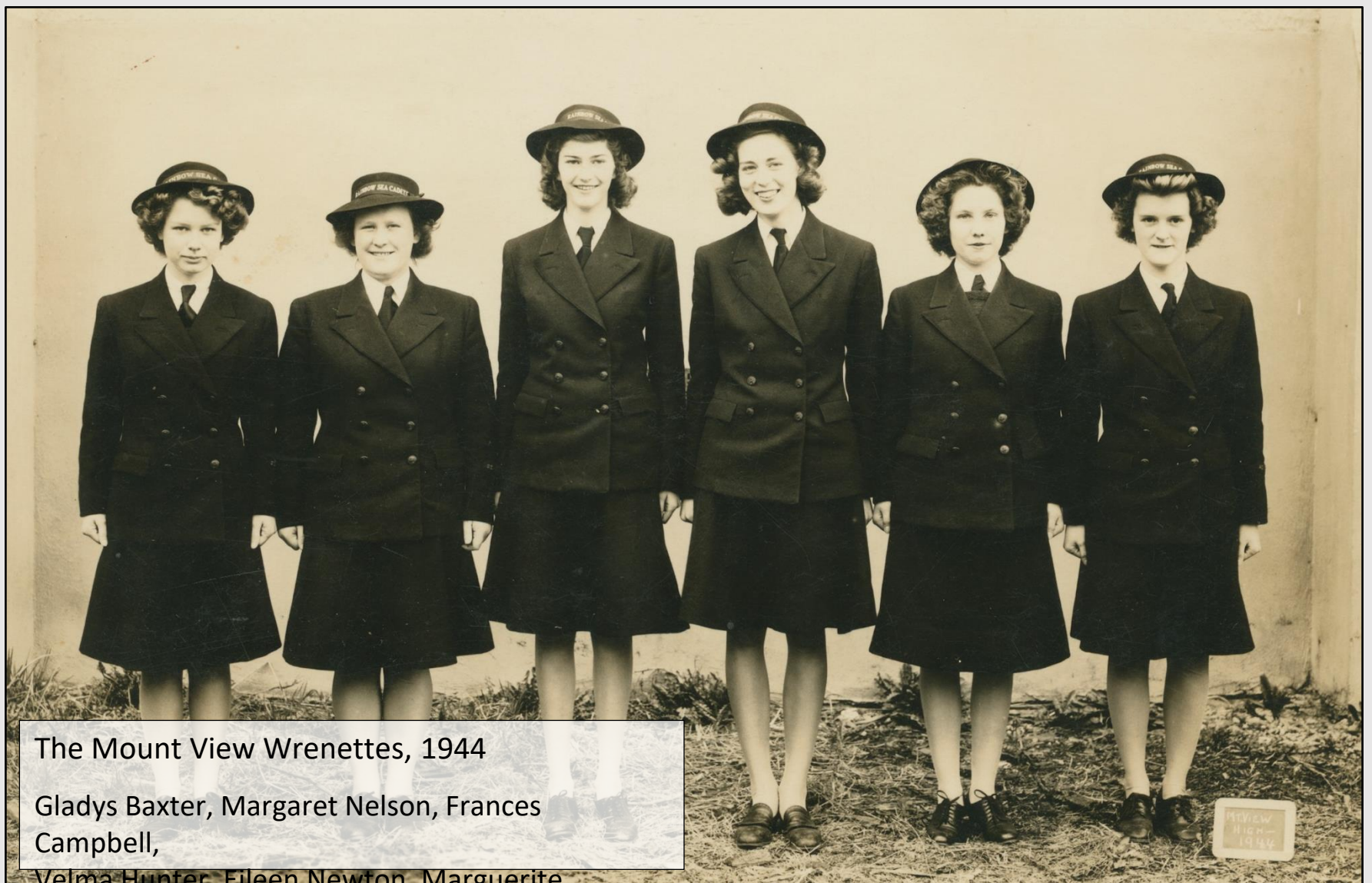
The Mount View Wrenettes, 1944

The Mount View Wrenettes , organized at Mount View High School in 1943, was one of the first Wrenette Companies in Canada.