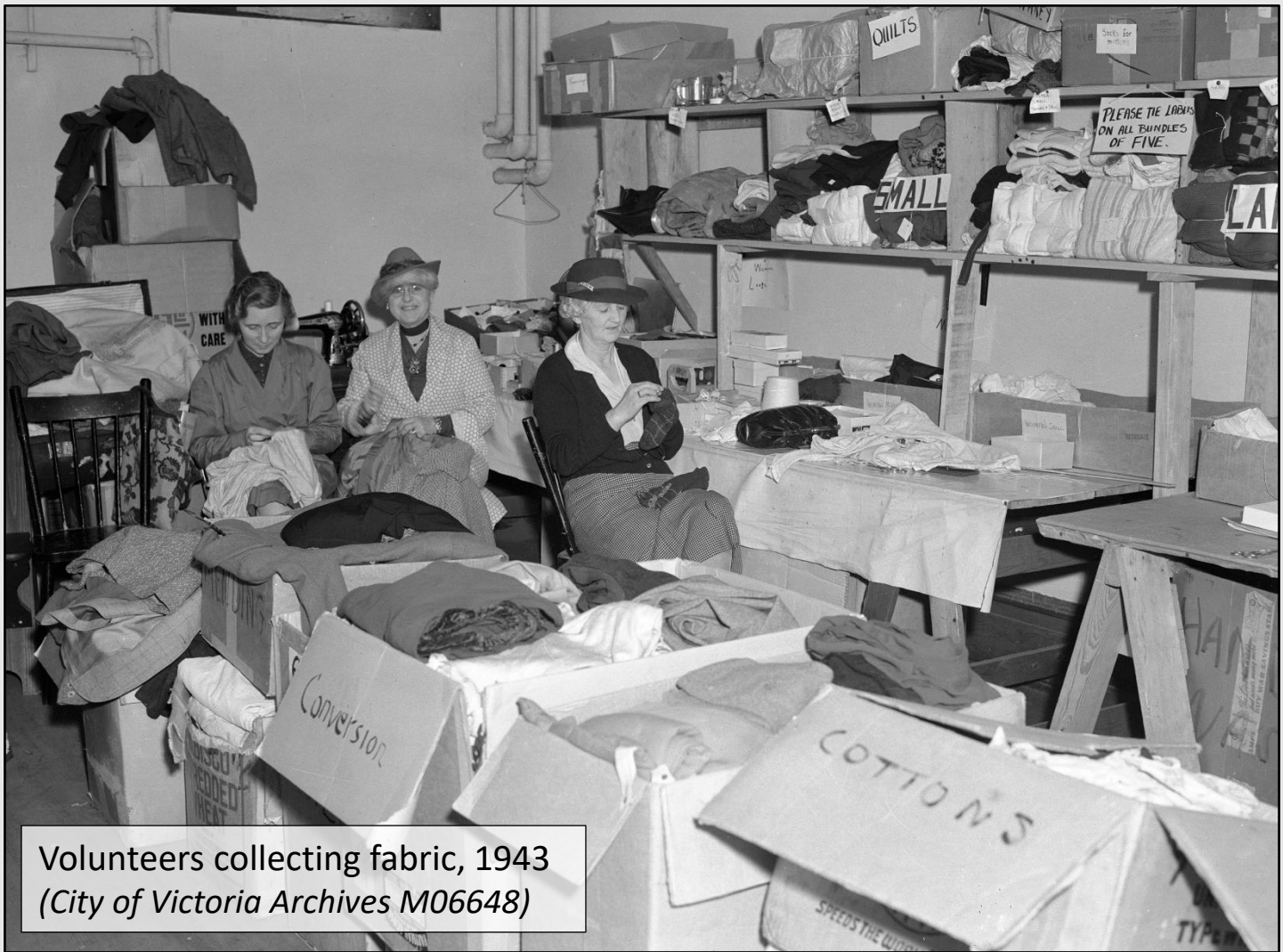
Volunteers collecting fabric, 1943