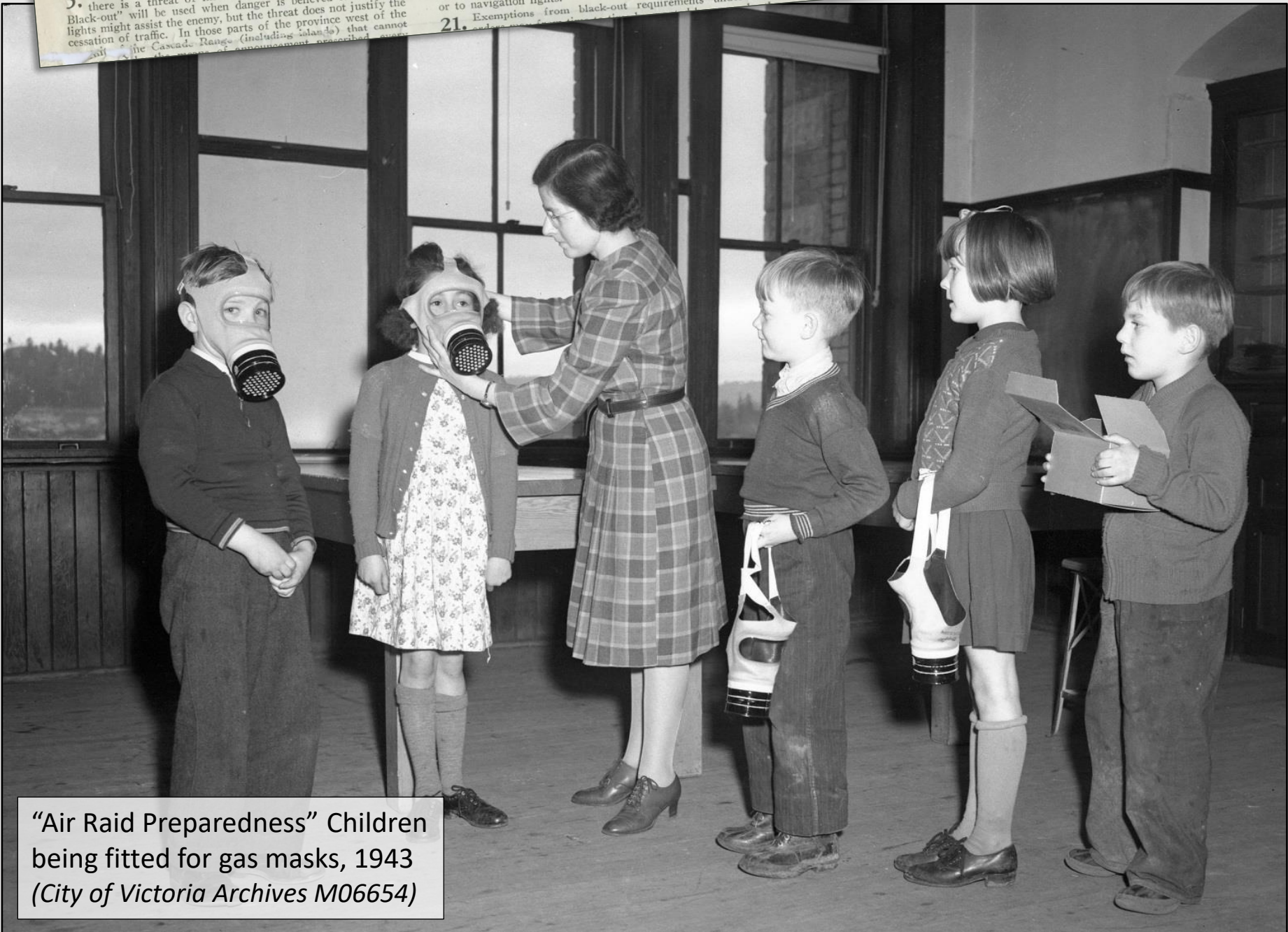
"Air Raid Preparedness" Children being fitted for gas masks, 1943 (City of Victoria Archives M06654)