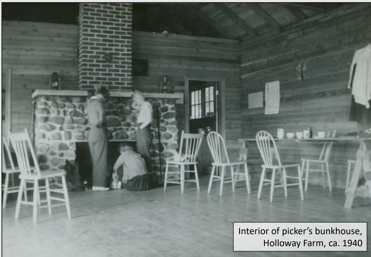
Interior of picker's bunkhouse, Holloway Farm, ca. 1940