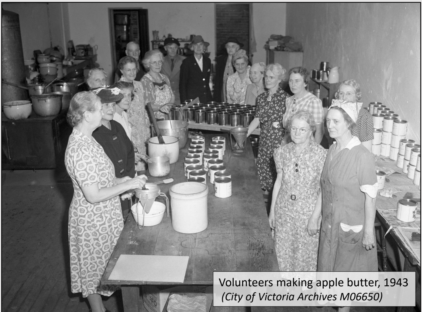
Volunteers making apple butter, 1943