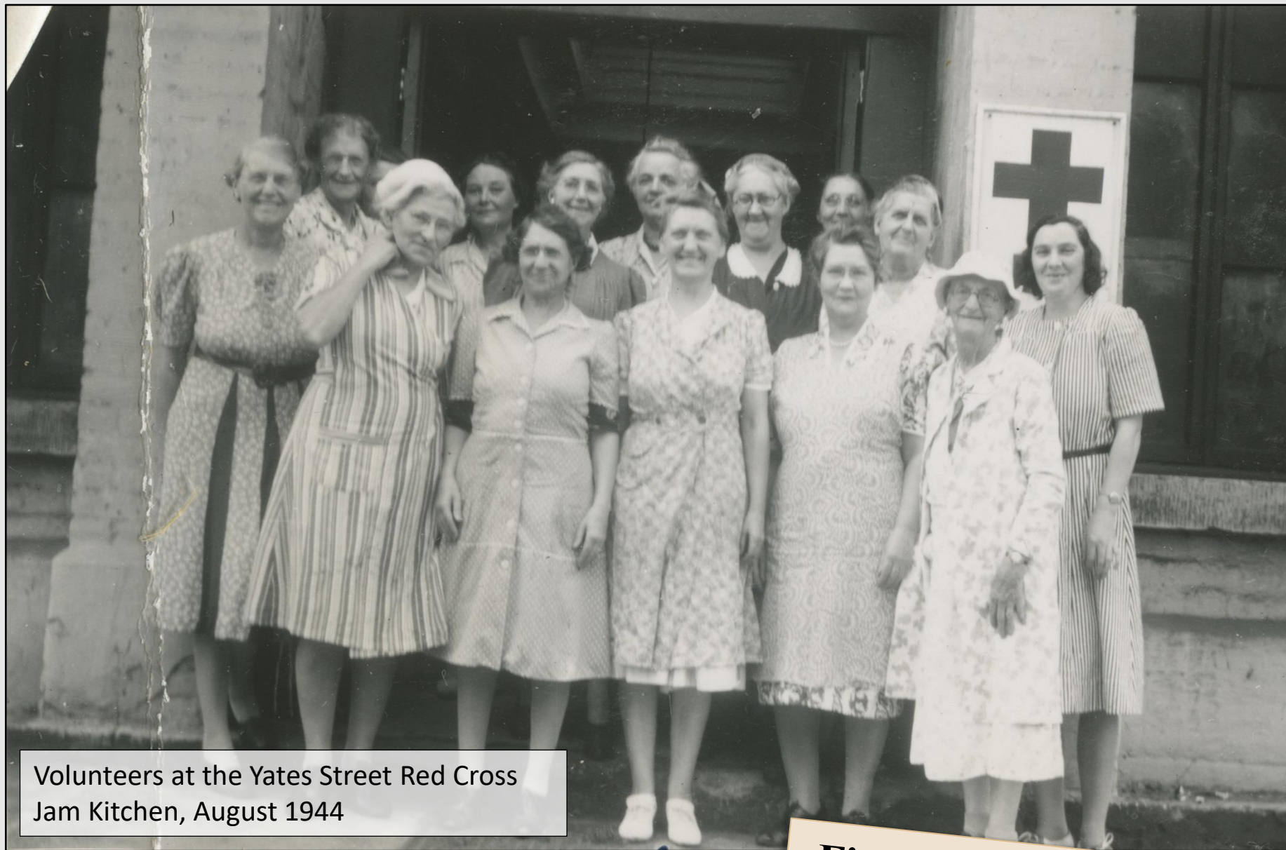
Volunteers at the Yates Street Red Cross Jam Kitchen, August 1944

During World War II, volunteers for the Canadian Red Cross Corps , a body of uniformed, trained and disciplined women ready for service in case of emergency, were mobilized to drive ambulances, support patients, and assist staff in military hospitals both at home and overseas.