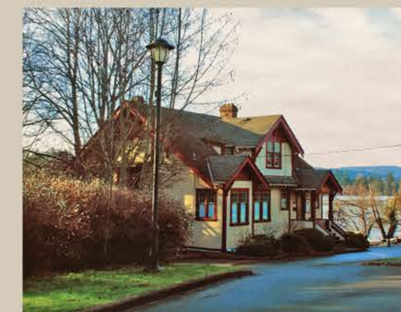
The Hamilton house in 2015

The historic boat-related use of the house continues with the Victoria Canoe & Kayak Club. They have rented the building from the District of Saanich since 1982 and provide recreational use of the Gorge Waterway.