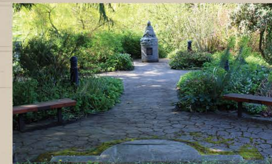
The Horspool garden looking towards Gorge Waterway (2016). Camossung public art installed in park.