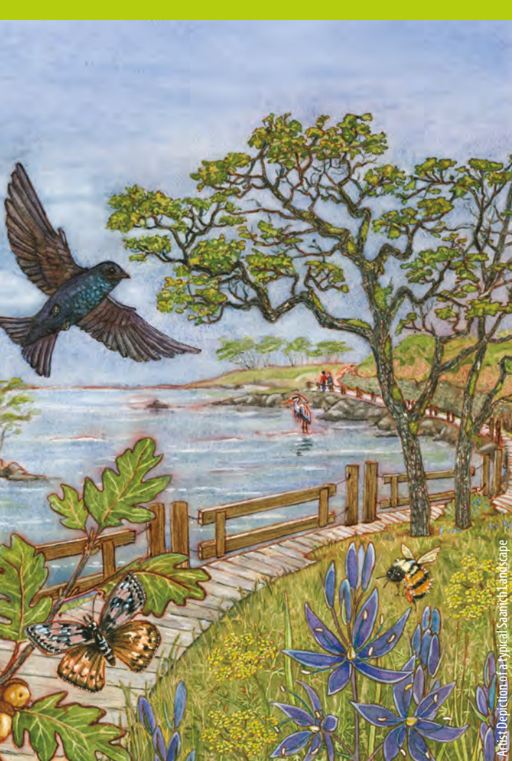
Greater Victoria NatureHood

NATURE IN THE CITY MAP One Map, One NatureHood, A Guide to Many Adventures First Edition 2021