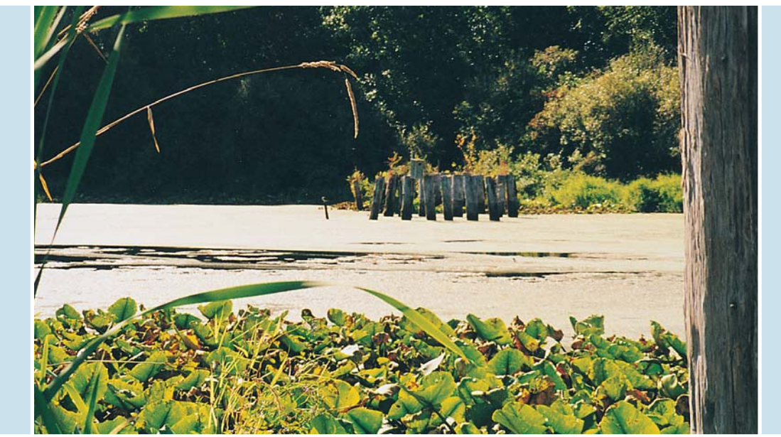
Remnants of the railway trestle built during World War I.

The driving of the "Last Spike" ceremony, held September 9, 2000 marked the official opening of the bridge.