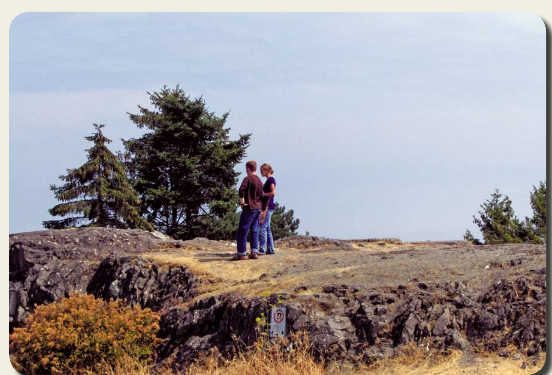
Geological feature at summit

Mount Tolmie is the highest peak in the Bowker Creek watershed and defines the eastern boundary. Over half of the original creek channel has been piped and is now underground. Bowker Creek and its watershed and meadows were an important part of the cultural heritage of Saanich. Songhees peoples managed the land using fire and cultivation of camas bulbs, which were a staple food and trade item.