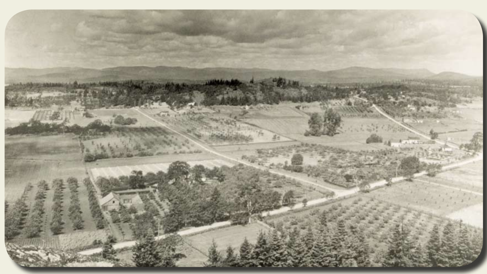
Vista of Shelbourne Valley 1906-08

This prominent park is a popular destination for residents and tourists, and to accommodate increasing numbers of visitors, improvements were made in 2010. These included the upgrade of the lower parking lot and the installation of the geographic marker at the summit, a joint project between the Mount Tolmie Community Association and the Saanich Rotary Club.