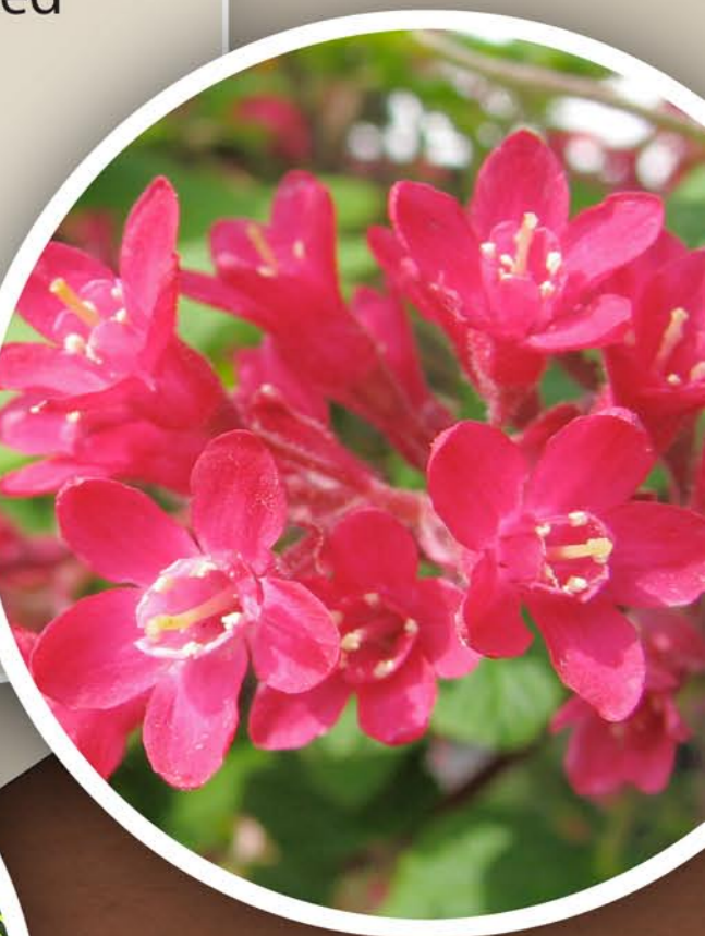
red-flowering currant ribes sanguineum

Land for Mount View Park (.54 ha or 1.3 acres) was dedicated during the Campus of Care development process. The plan for the park was developed through consultation with area residents and the Mount View Colquitz Community Association, and approved by the District of Saanich in 2011. Its construction was funded by the Capital Regional Hospital District, Morguard Investments Limited and Saanich Parks.