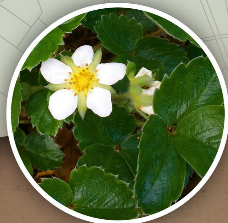
coastal strawberry fragaria chiloensis