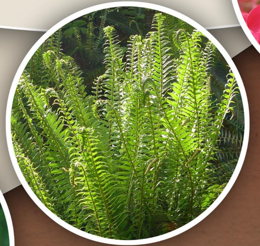
swordfern polystichum munitum