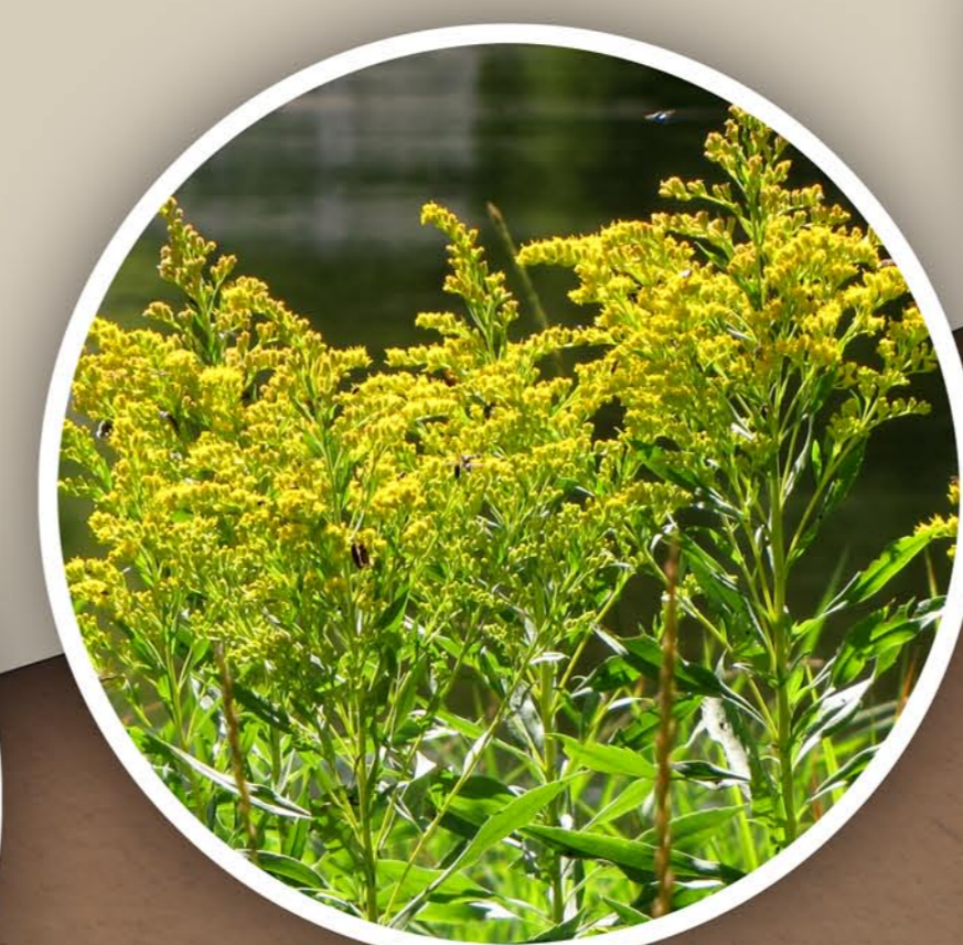
goldenrod solidago spp.