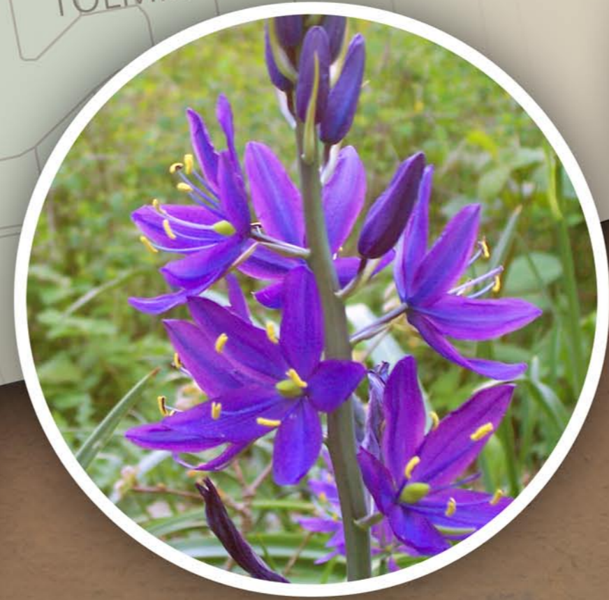
camas camassia quamash