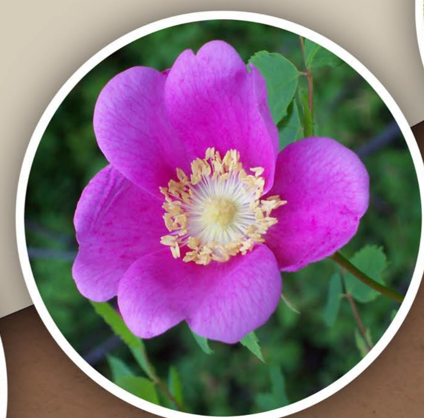
nootka rose rosa nutkana