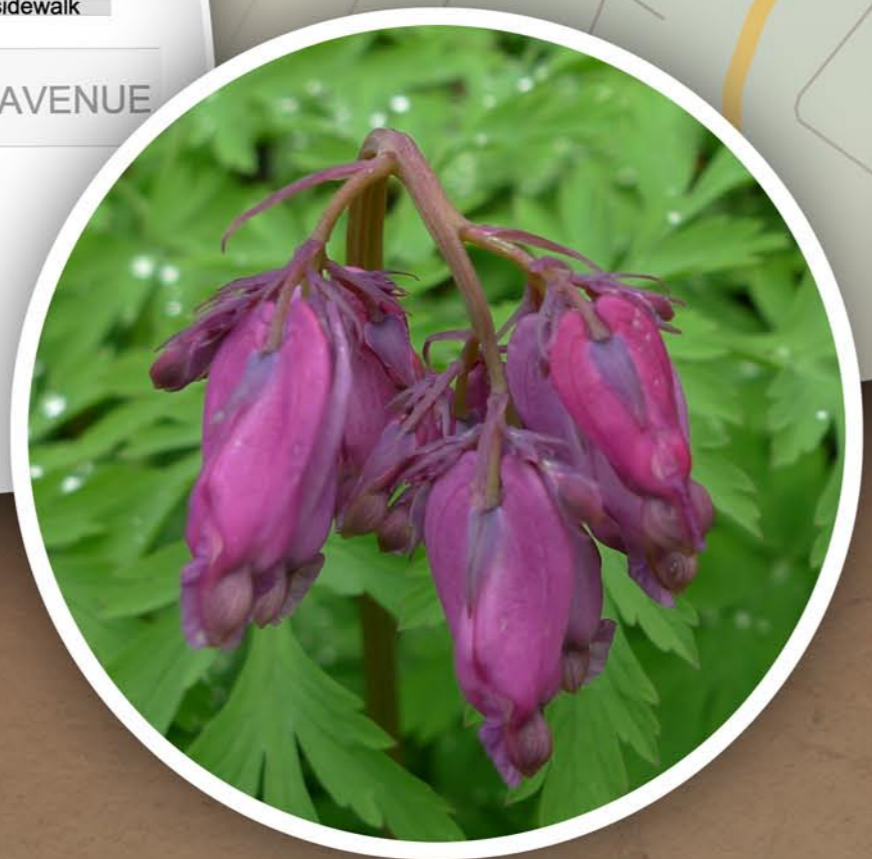
bleeding heart dicentra formosa