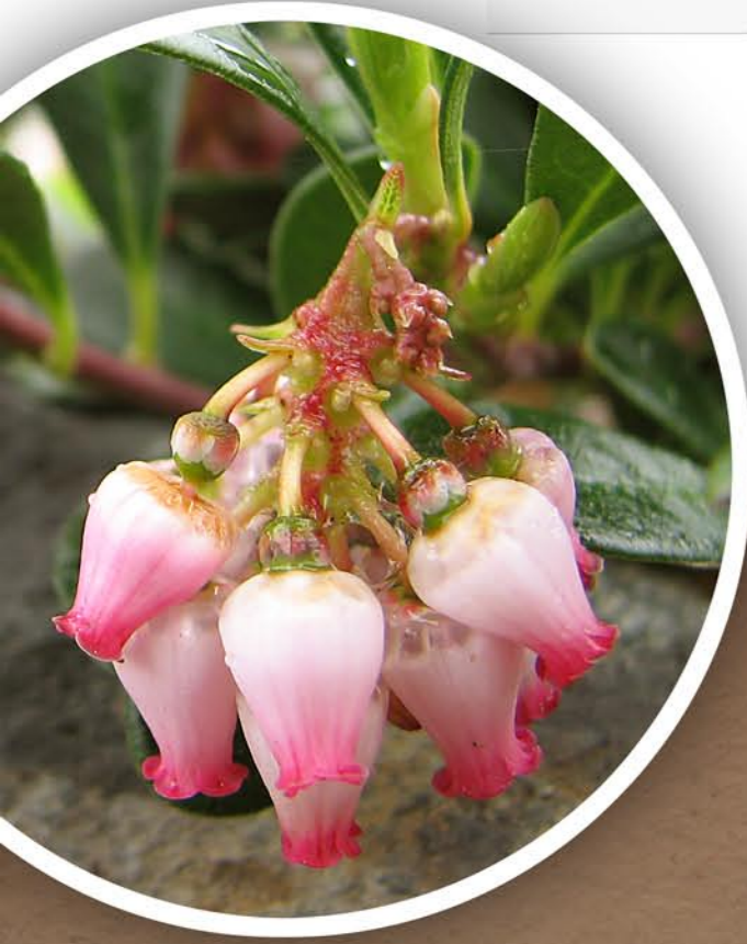
kinnikinnick arctostaphylos uva-ursi