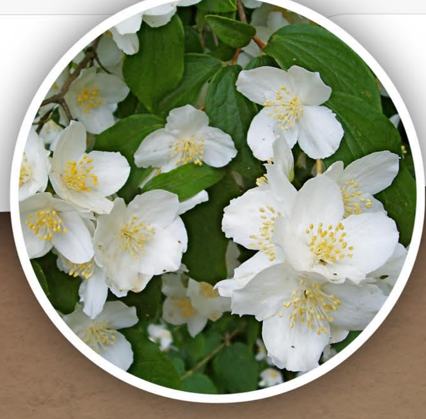
mock orange philadelphus lewisii