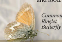
Common Ringlet Butterfly