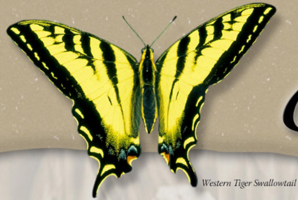
Western Tiger Swallowtail