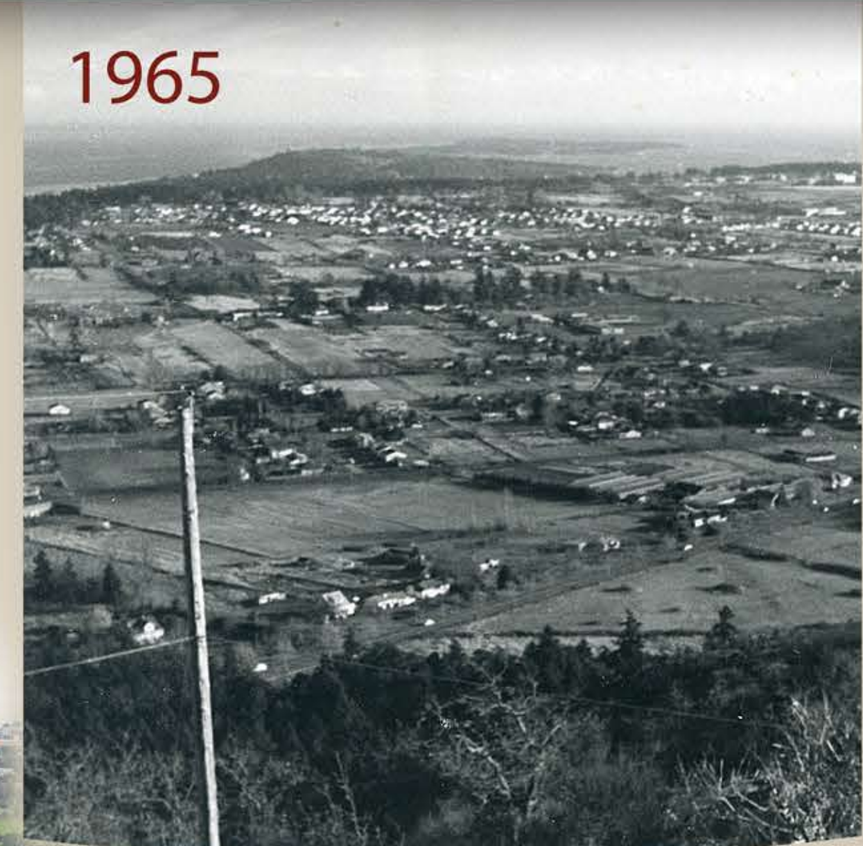
2021 1965