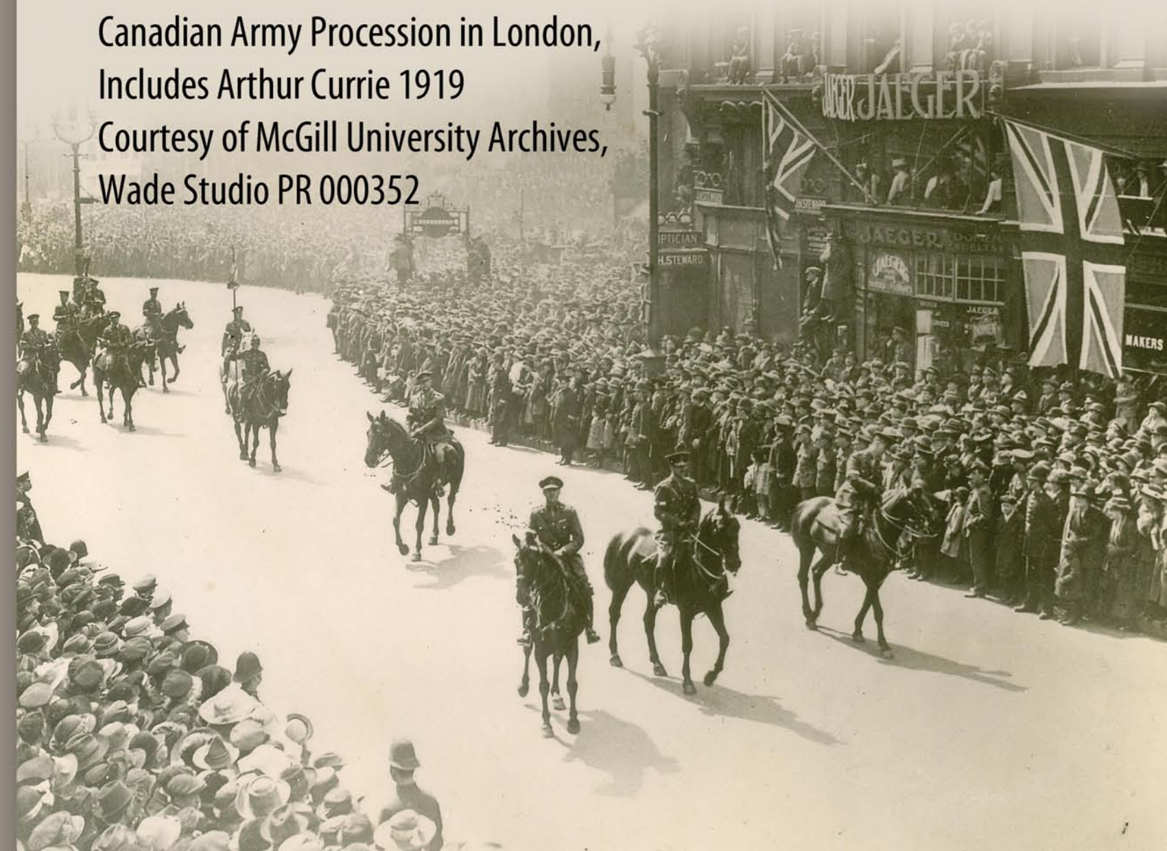
Canadian Army Procession in London, Includes Arthur Currie 1919

Arthur Currie returned to Victoria in 1931; he planted a copper beech in Mayor's Grove, Beacon Hill Park. The tree flourishes to this day.