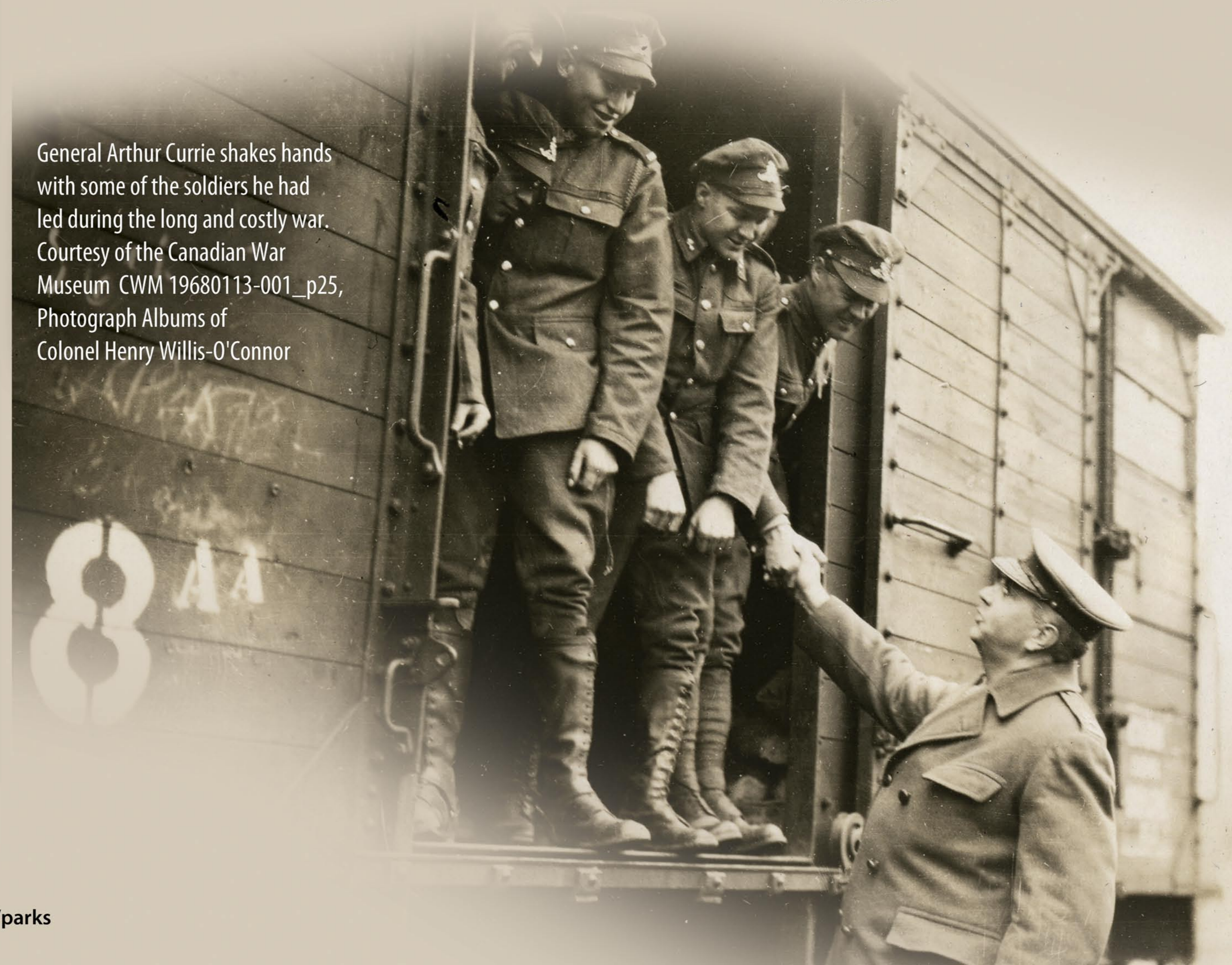
General Arthur Currie shakes hands with some of the soldiers he had led during the long and costly war.