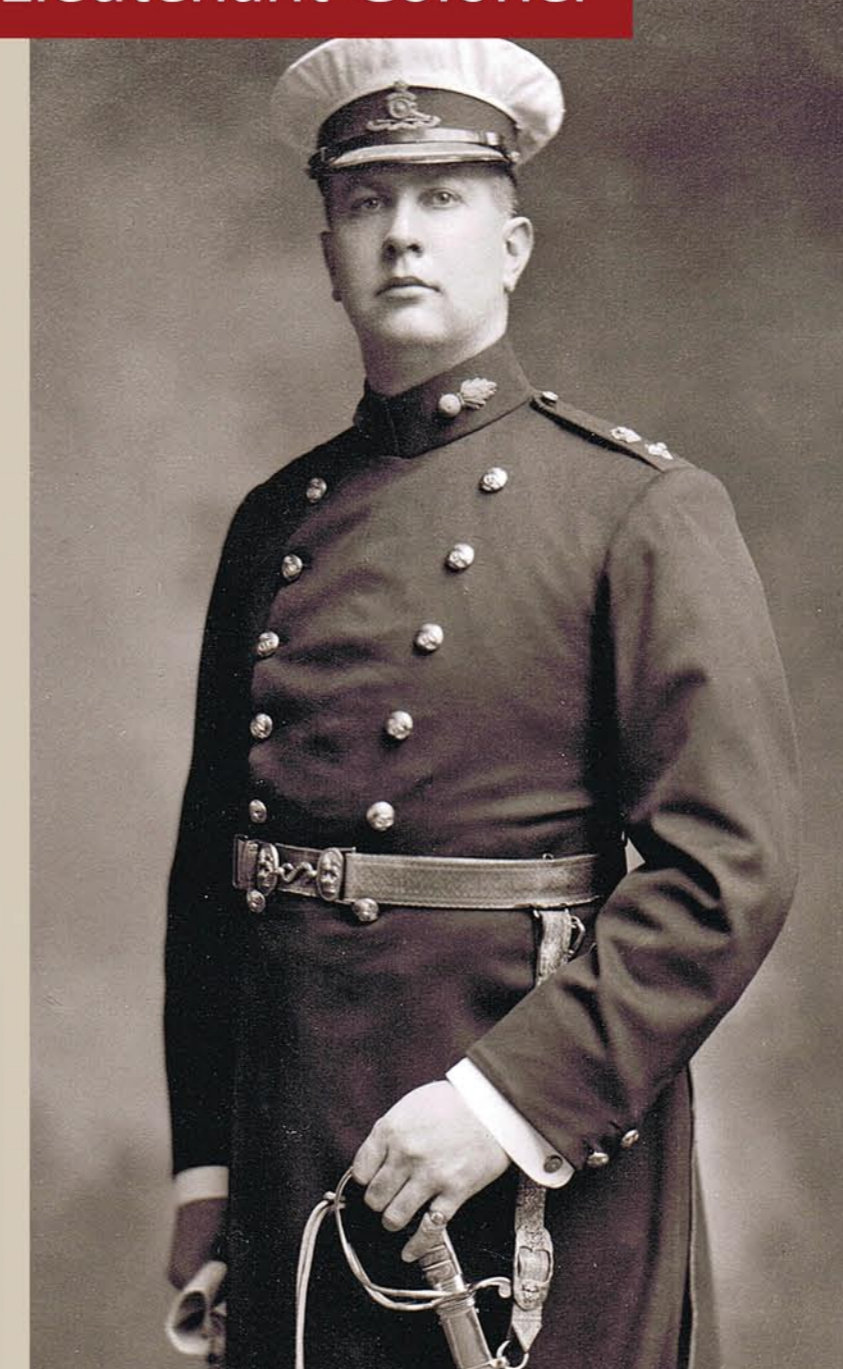
Lieutenant Colonel Arthur Currie, 1909