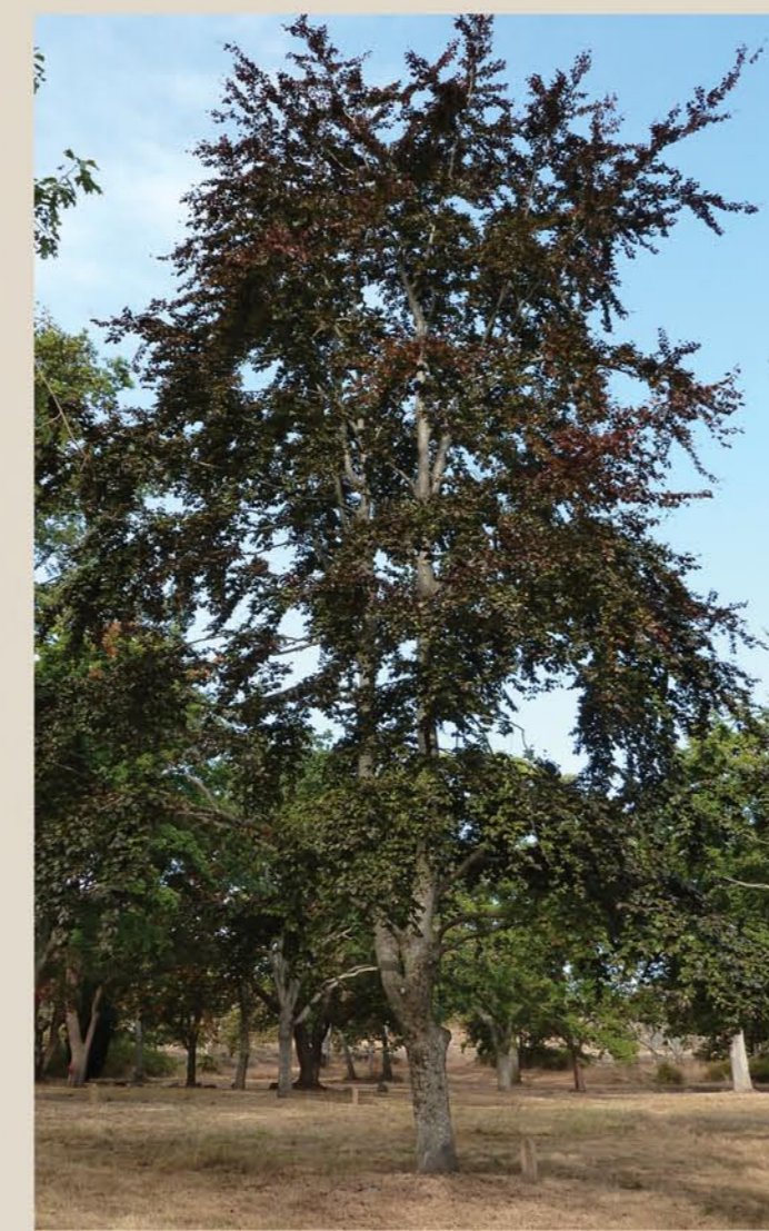
Currie Beech tree, Mayor's Grove - Beacon Hill Park, Victoria BC