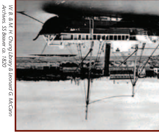
SS Beaver ca. 1820