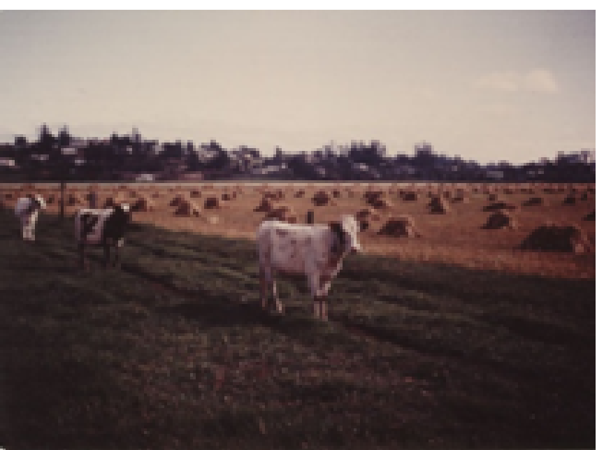
Edge Farm, 1968

Zoning: P4N (Natural Park) Size: 11.68 Hectares