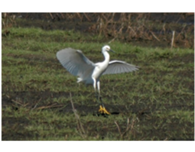
Snowy Egret May 2012