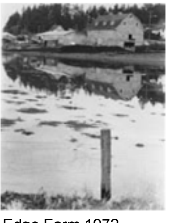
Edge Farm 1972