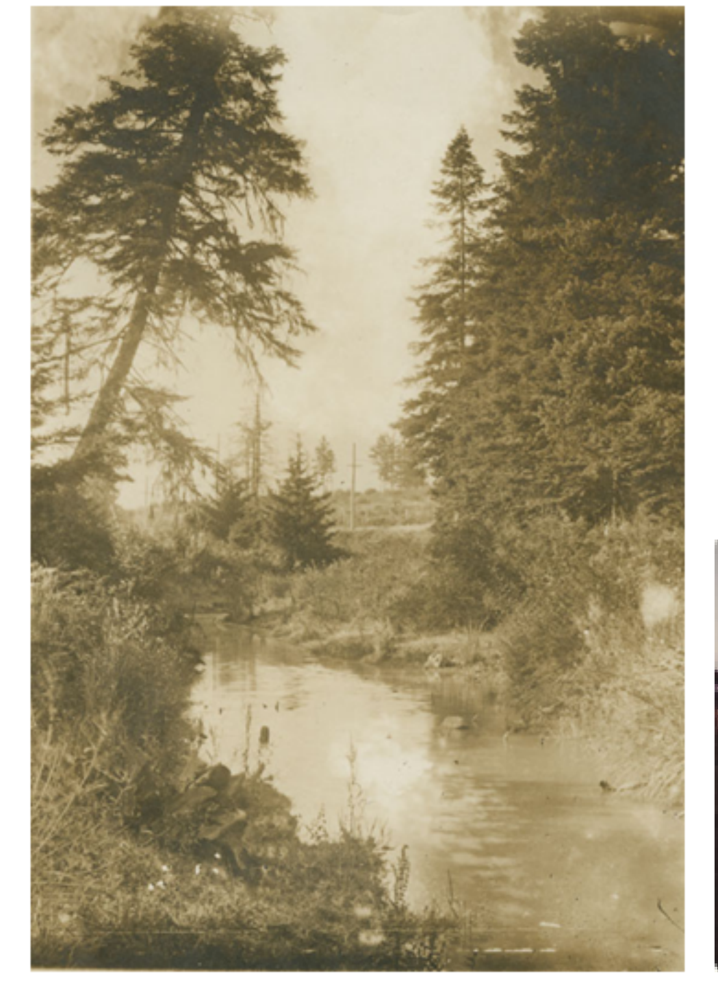
Colquitz River, 1913