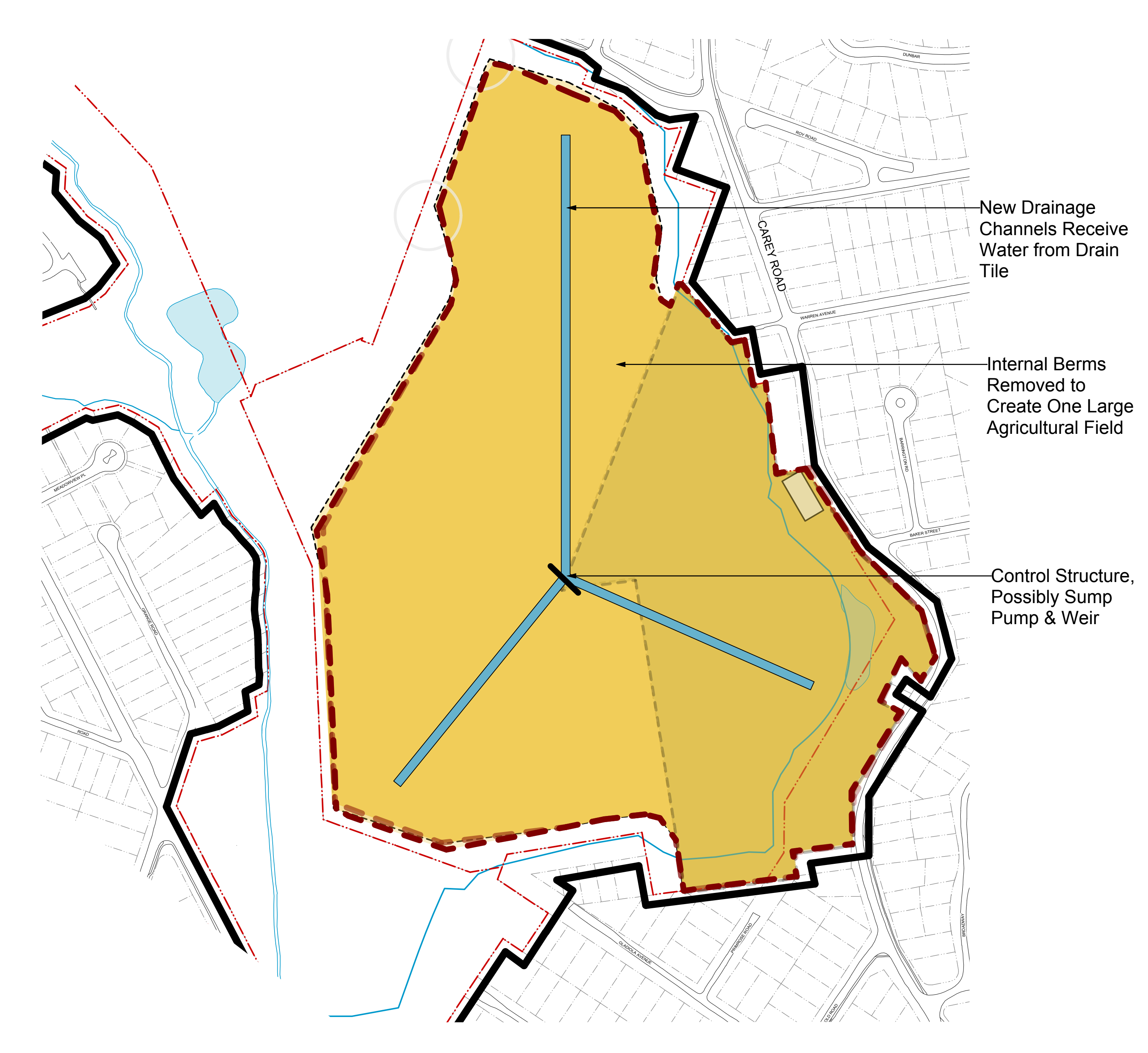
Potential Strategy #2