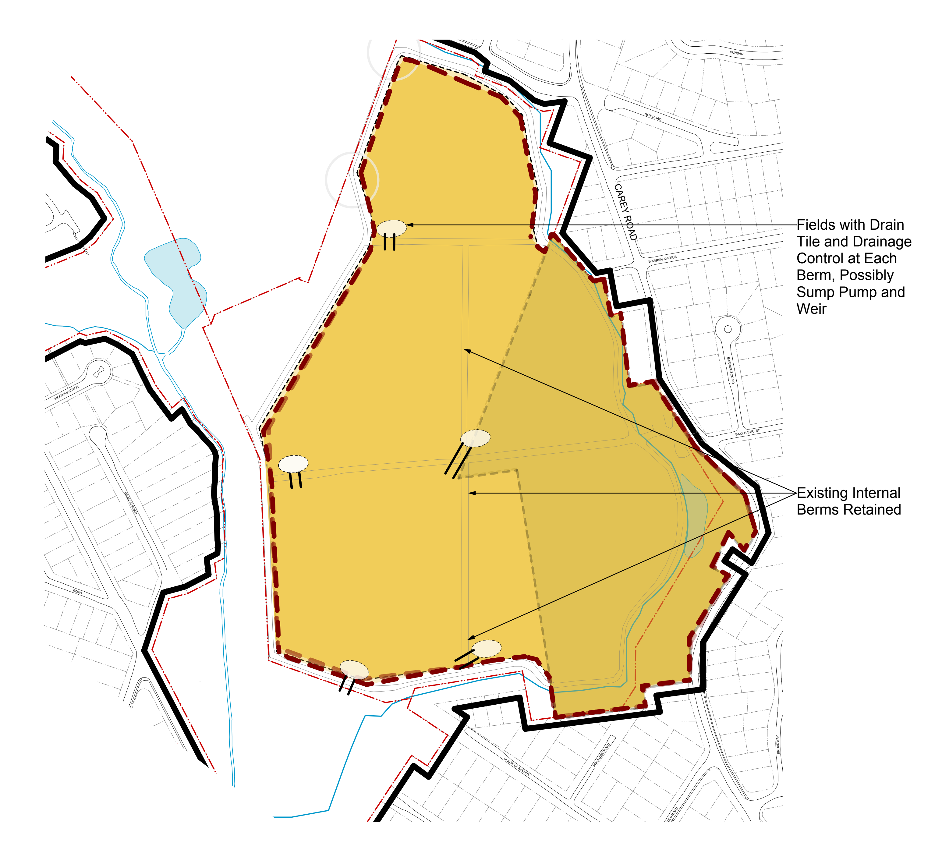
Potential Strategy #1