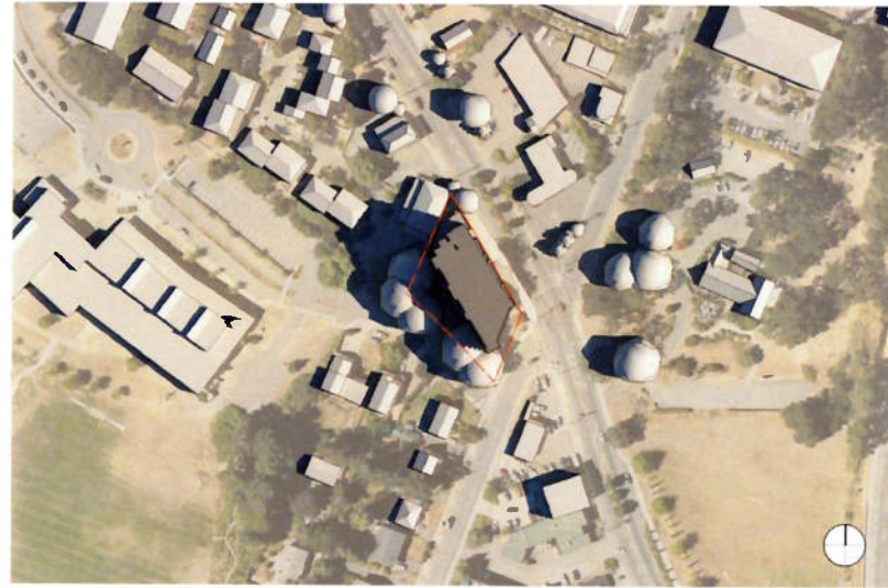
1 June 21st - 9:00am

THIS DOCUMENT HAS BEEN ELECTRONICALLY CERTIFIED WITH DIGITAL CERTIFICATE AND ENCRYPTION TECHNOLOGY AUTHORIZED BY THE A.A.B.C. THE AUTHENTIC ORIGINAL IN ELECTRONIC FORM. ANY PRINTED VERSION CAN BE REPLIED UPON AS A TRUE COPY OF THE ORIGINAL. PHOTOGRAPHS BY D'AMBROSIO ARCHITECTURE + URBANISM BEARING IMAGES OF THE PROFESSIONAL SEAL AND DIGITAL CERTIFICATE OR WHEN PRINTED FROM THE DIGITALLY CERTIFIED ELECTRONIC FILE.