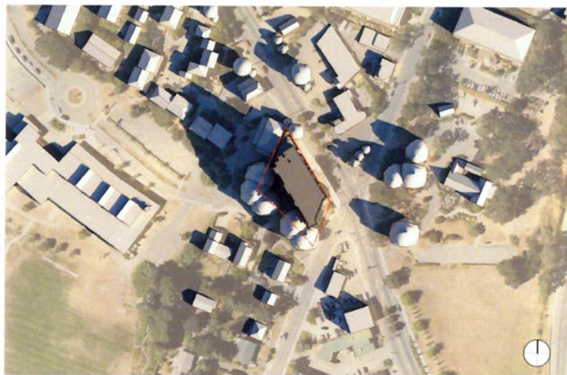
4 March / September 19th - 9:00am