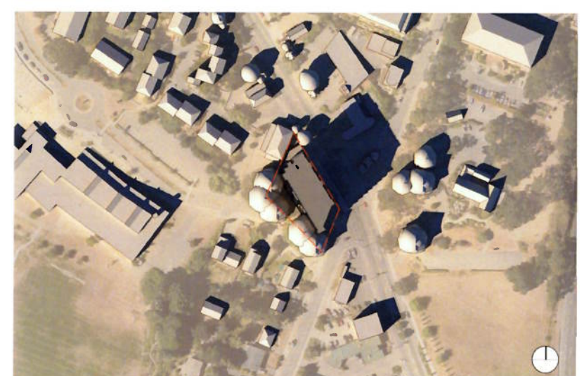
6 March / September 19th - 5:00pm