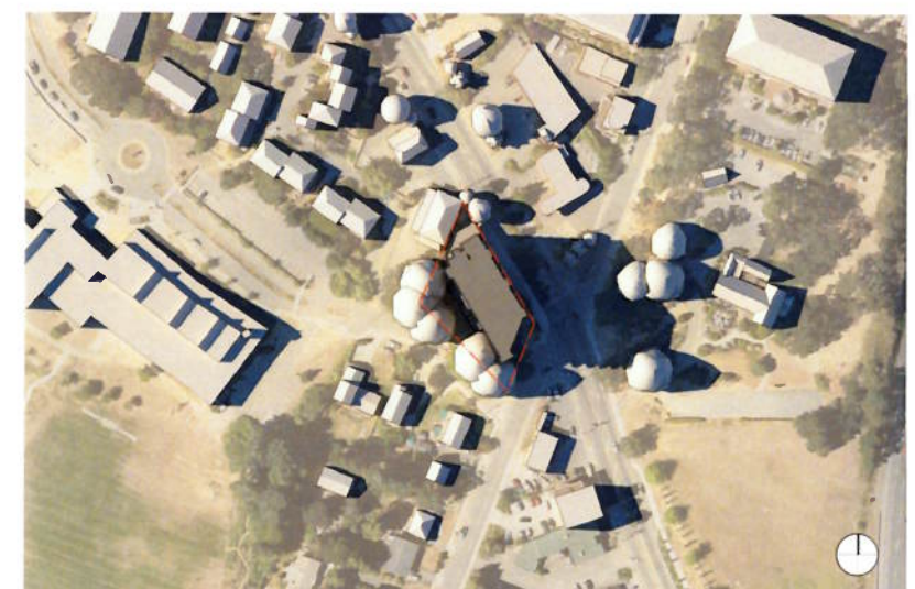
3 June 21st - 5:00pm