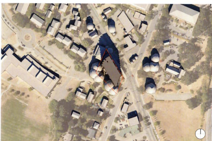
5 March / September 19th - 12:00pm