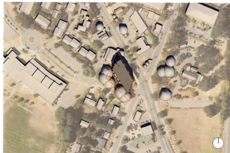
2 June 21st - 12:00pm