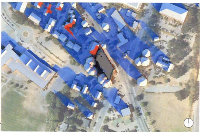
7 December 21st - 9:00am