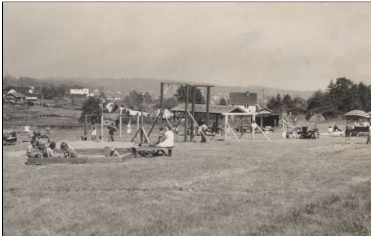
Children's playground group at Rudd Park, ca. 1946 (2012-008-016)