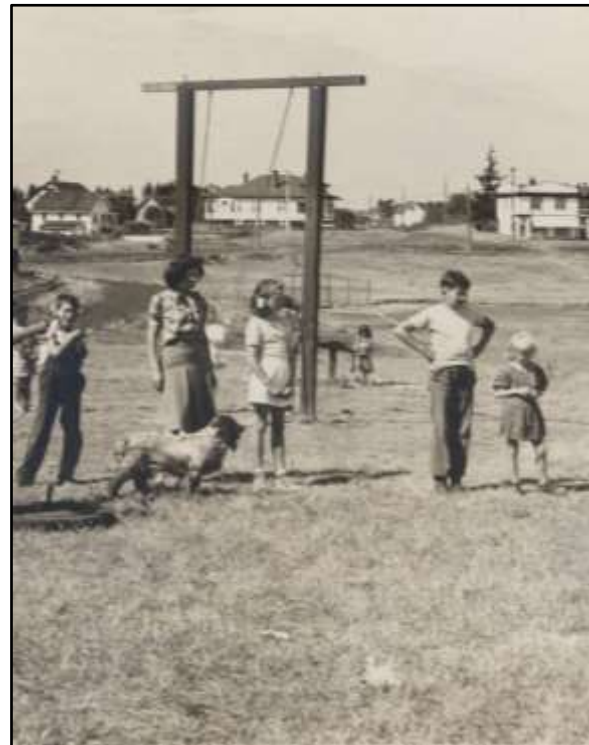
Children's playground group at Rudd Park, ca. 1946 (2012-008-006)