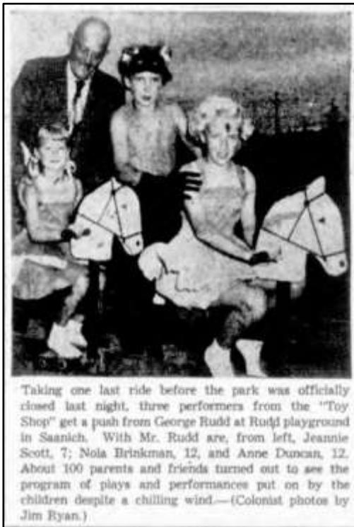
Colonist, 15 August 1952